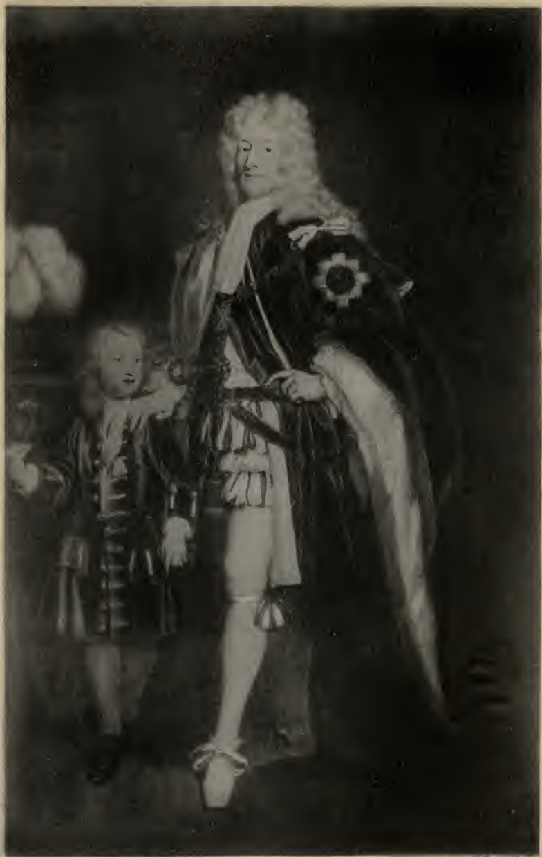
JOHN ERSKINE, ELEVENTH EARL OF MAR, AND HIS SON THOMAS, LORD ERSKINE

from the portrait by Sir Godfrey Kneller in the possession of the Earl of Mar and Kellie