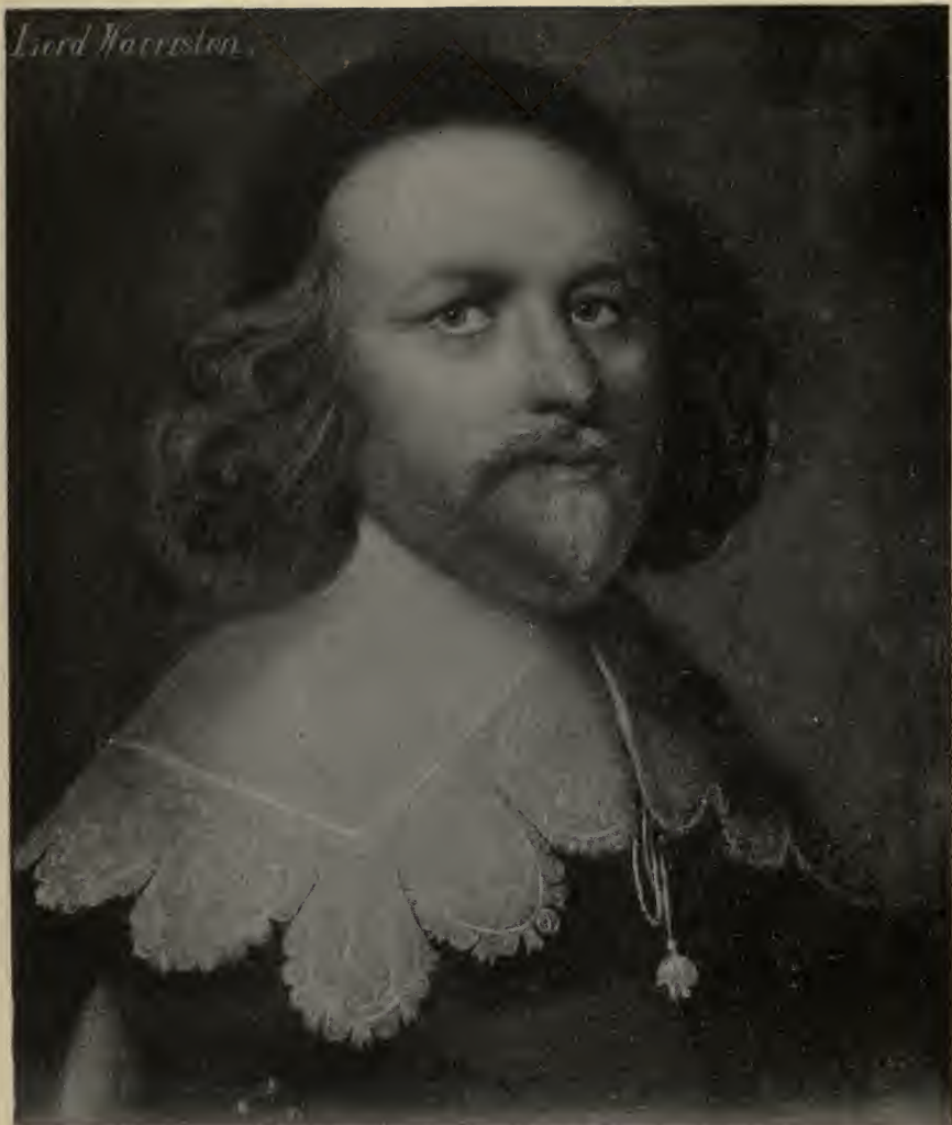
ARCHIBALD JOHNSTON, LORD WARISTON