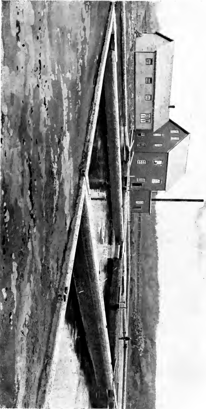
PRECIPITATING WORKS AT WORCESTER, MASS.