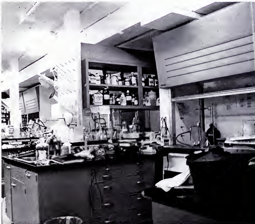
The laboratory at City of Hope in which the DNA synthesis for the somatostatin project was performed.