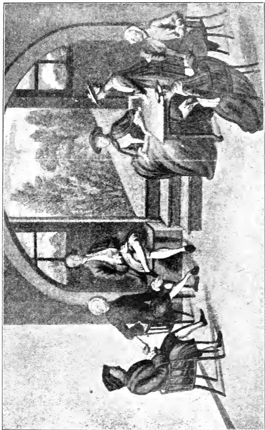
RICHARDSON READING "GRANDISON" IN THE GROFFO AT FULHAM.