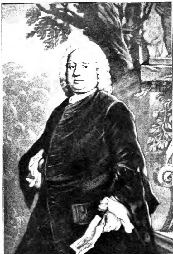
SAMUEL RICHARDSON. After Highmore.