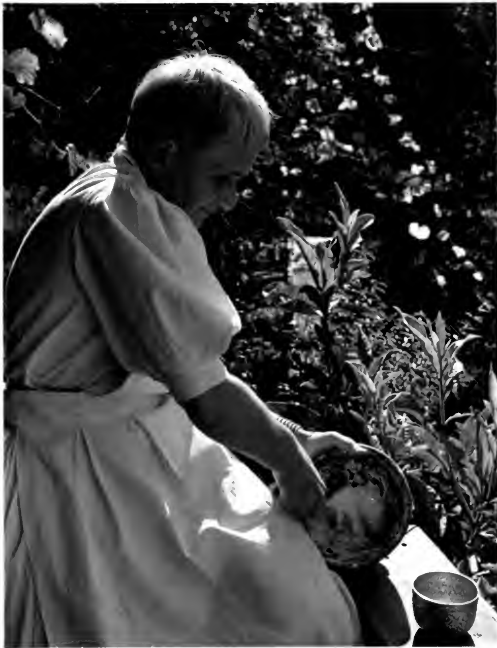
Dorothea Lange in 1956