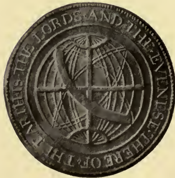
PREROGATIVE SEAL, 1801. Size—One inch and three-eighths in diameter.