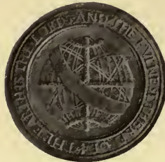
PREROGATIVE SEAL, 1765. Size—One inch and one eighth in diameter.