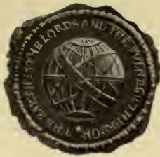
PREROGATIVE SEAL, 1699. Size—One inch and one-sixteenth in diameter.