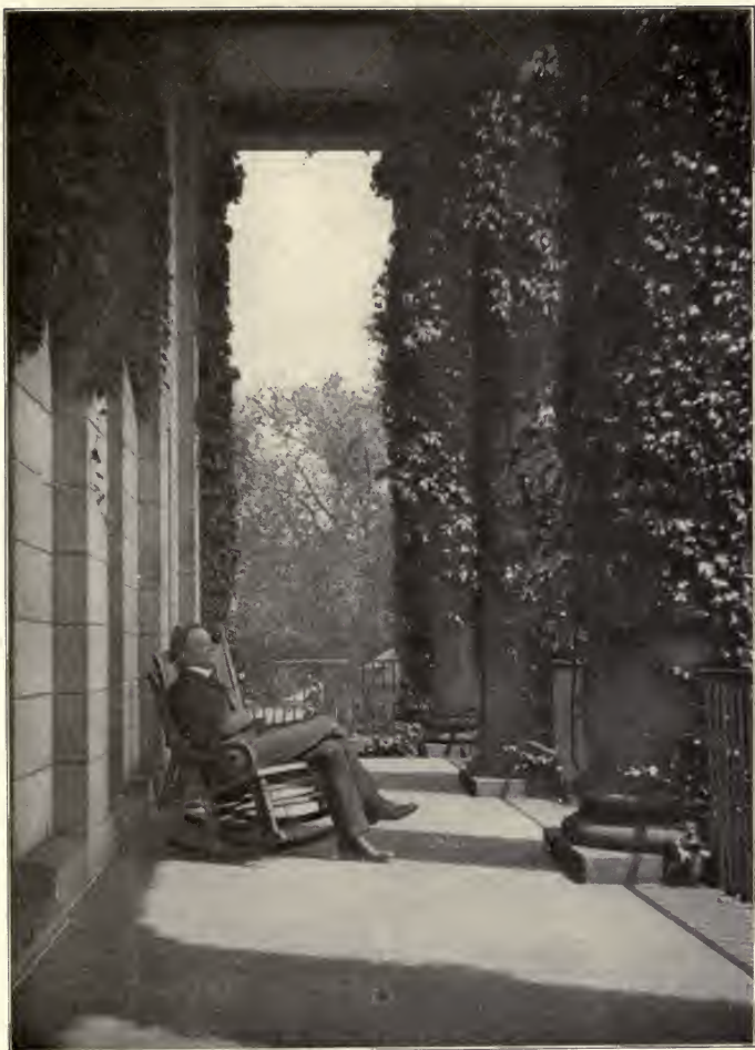
THE BULFINCH FRONT OF THE MASSACHUSETTS GENERAL HOSPITAL