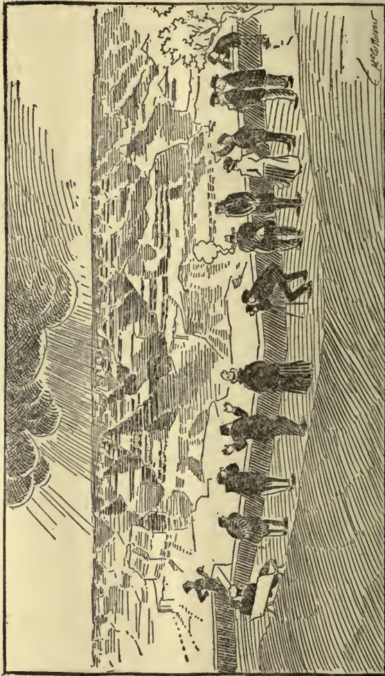
"In silent contemplation."