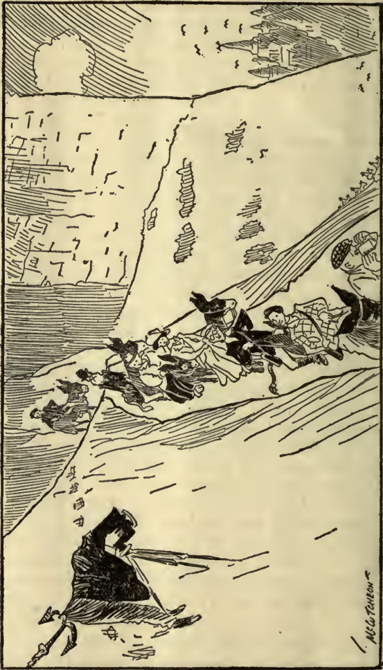
"The dare-devil photographer."