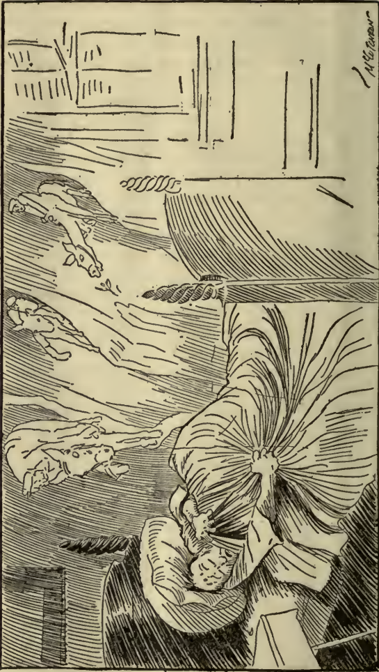
“—As in your sleep you dream of things infernal.”