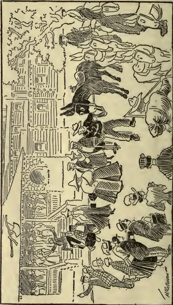
"The start from the hotel."