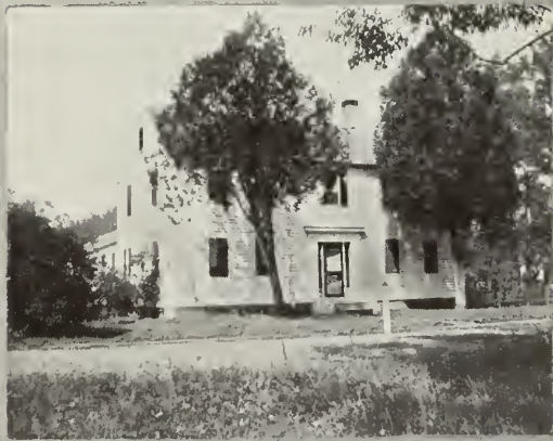
THE VILLAGE HOME