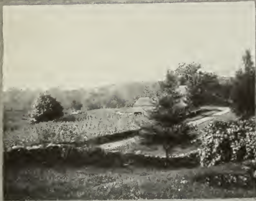
THE CORN-FIELD AND NORTH BARN