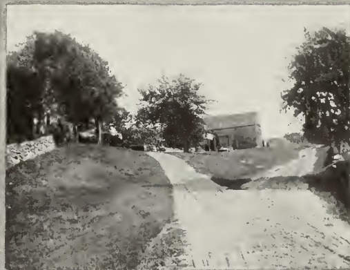
APPROACHING THE HOMESTEAD