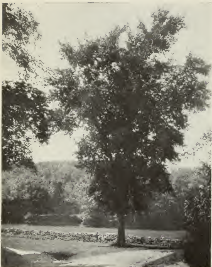
MOTHER'S ELM IN 1905