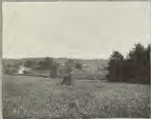
NEARING THE FARM