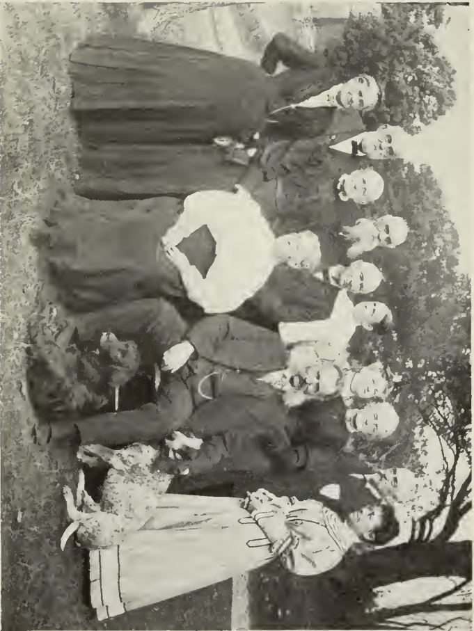
THE FAMILY REUNION AT THE OLD HOMESTEAD IN 1907