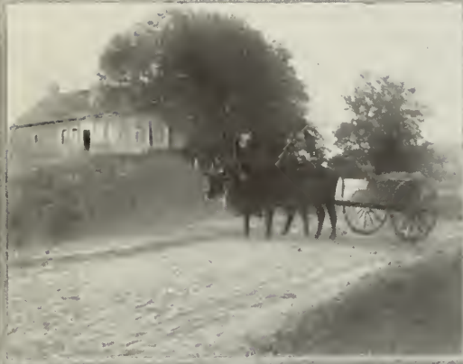
1. NORTH DOOR