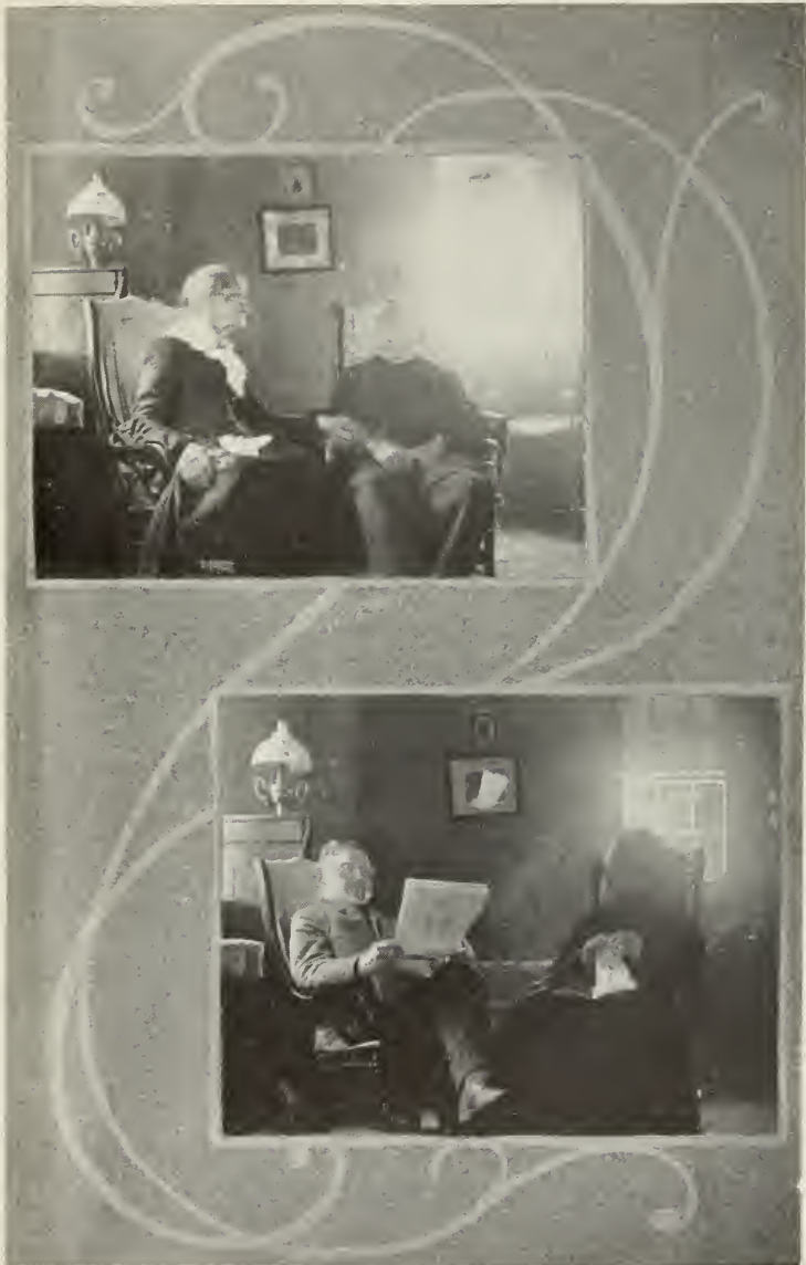
GRANDMOTHER AND GRANDFATHER