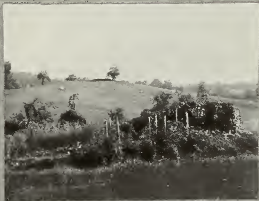
THE TERRACED GARDEN