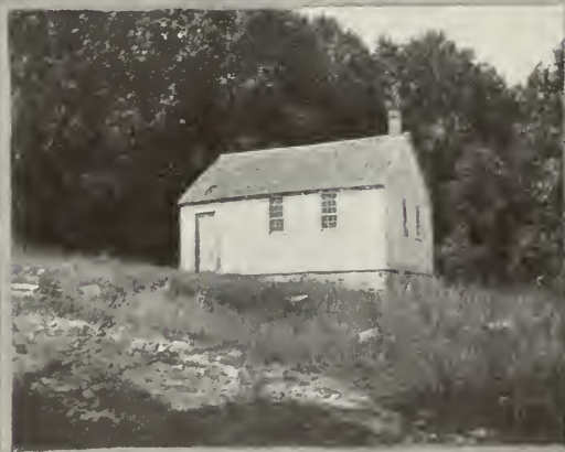
LITTLE RED SCHOOL-HOUSE