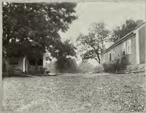
2. SOUTH DOOR WITH WELL-HOUSE