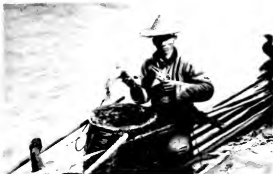
FEEDING THE CORMORANT AFTER THE CATCH

on Min River near Fuchow, Fu-kien Province