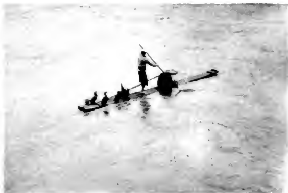
FISHERMAN ON BAMBOO RAFT WITH CORMORANTS