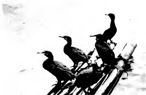
CORMORANTS PERCHING ON BAMBOO RAFT

on Min River near Fuchow, Fu-kien Province