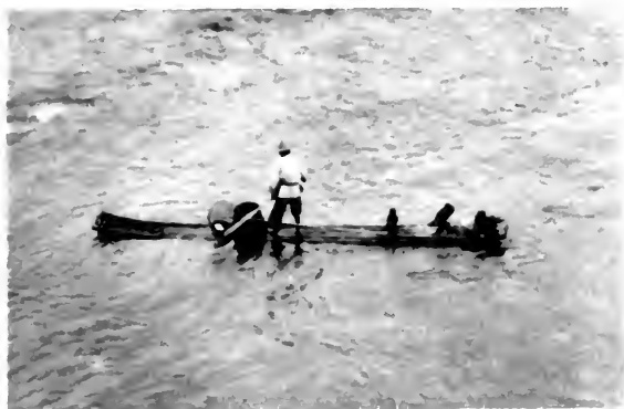
FISHING WITH CORMORANTS ON BAMBOO RAFT