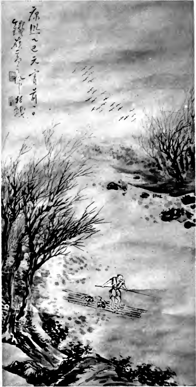
CORMORANT FISHER, FINGER-PAINTING BY KAO K'I-P'EI