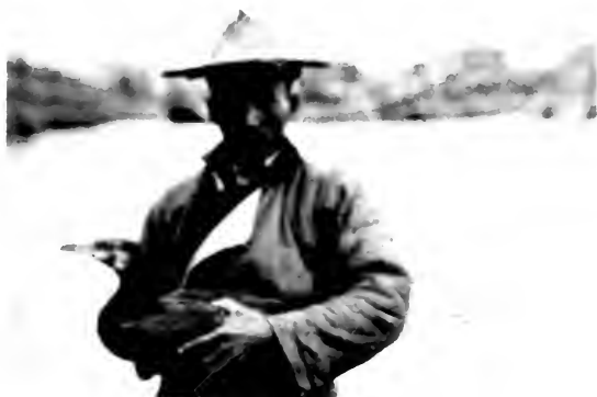
FISHERMAN HOLDING CORMORANT