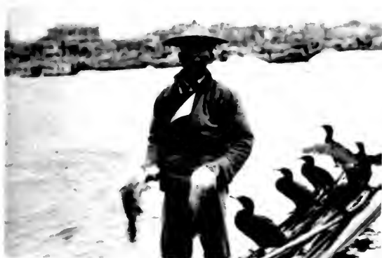
PLACING THE CATCH IN A BASKET