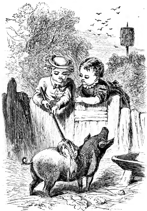
WASHING THE PIG. — Page 137.