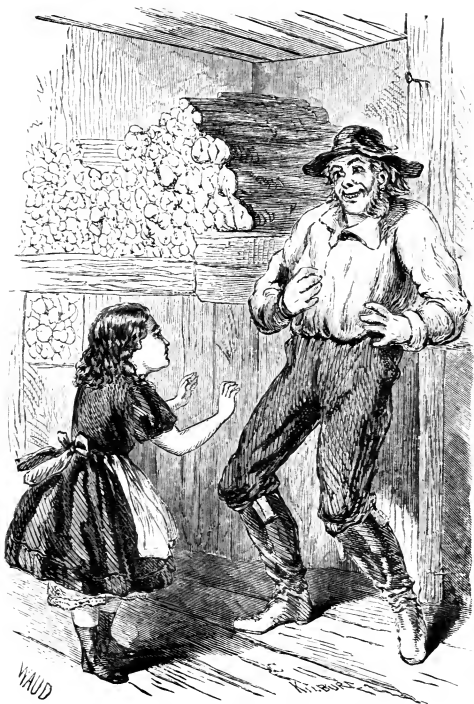
A DARK DAY. — Page 154.