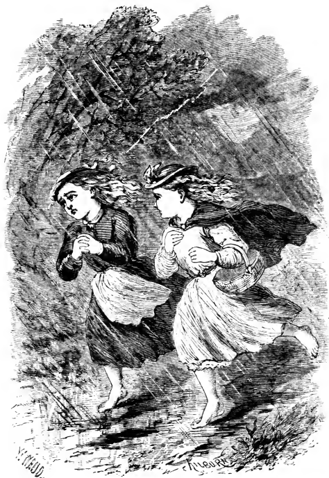
A SAD FRIGHT. Page 80.