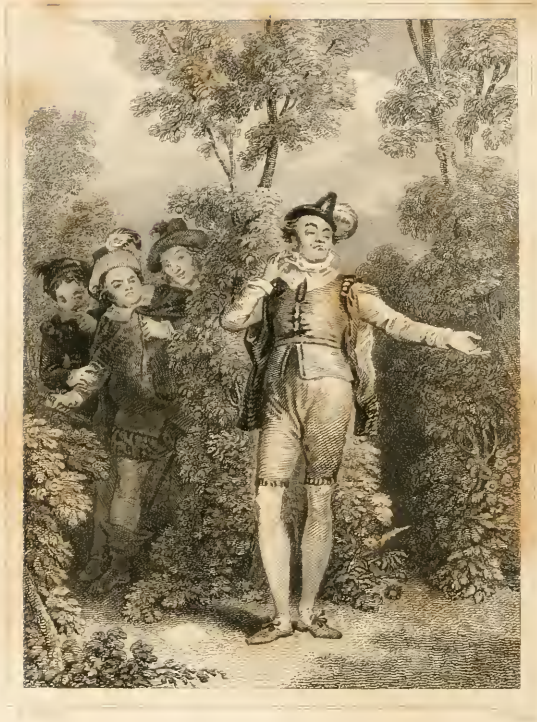
THE MAN IN THE RUFF AND THE WOMAN IN THE BONNET A SCENE IN A GARDEN