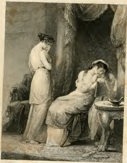
Scene in the Interior