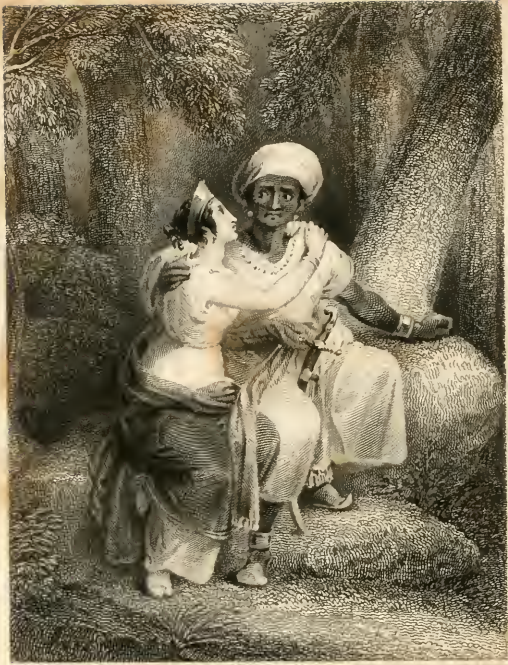
THE MAN AND THE WOMAN IN THE FOREST