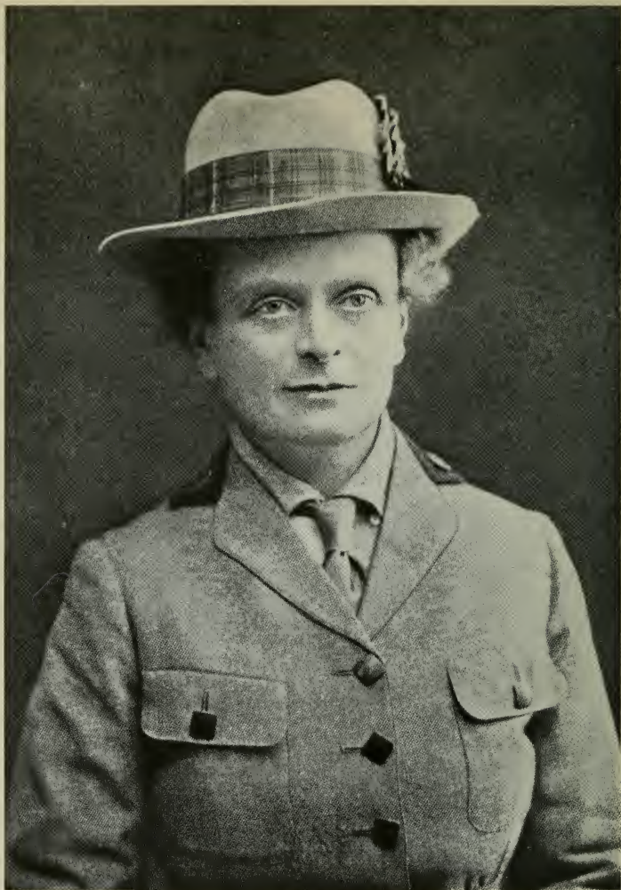
DR. ELSIE INGLIS, 1916