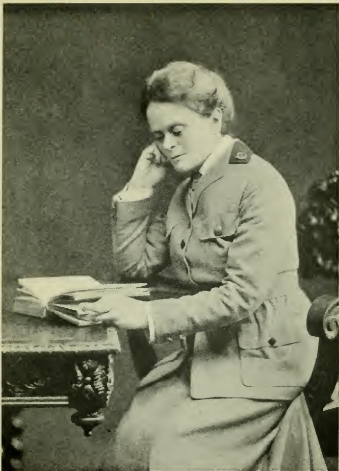
DR. ELSIE INGLIS, 1916