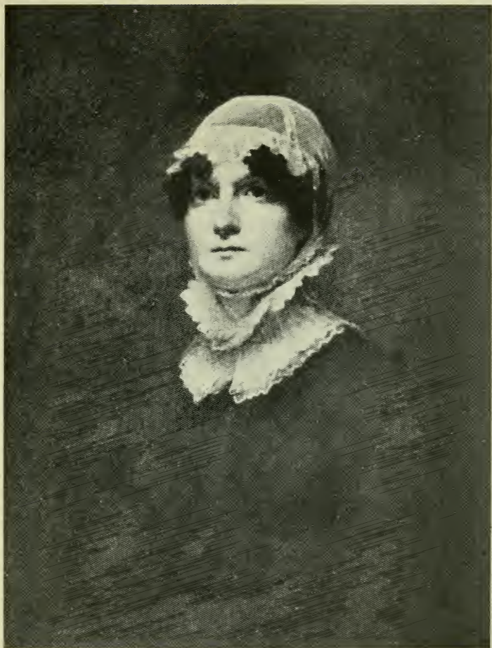
(Portrait by Raeburn)