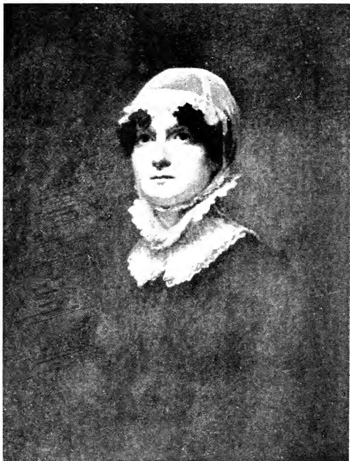
(Portrait by Raeburn)