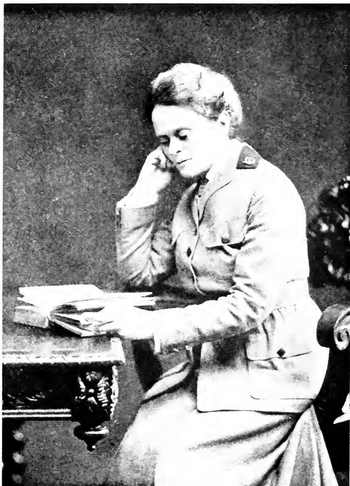
DR. ELSIE INGLIS, 1916