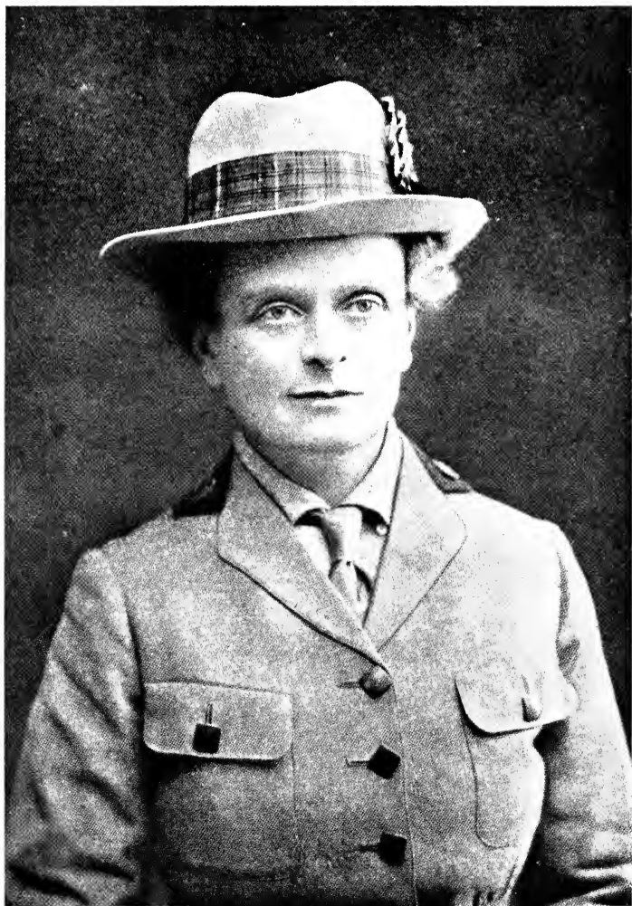
DR. ELSIE INGLIS, 1916