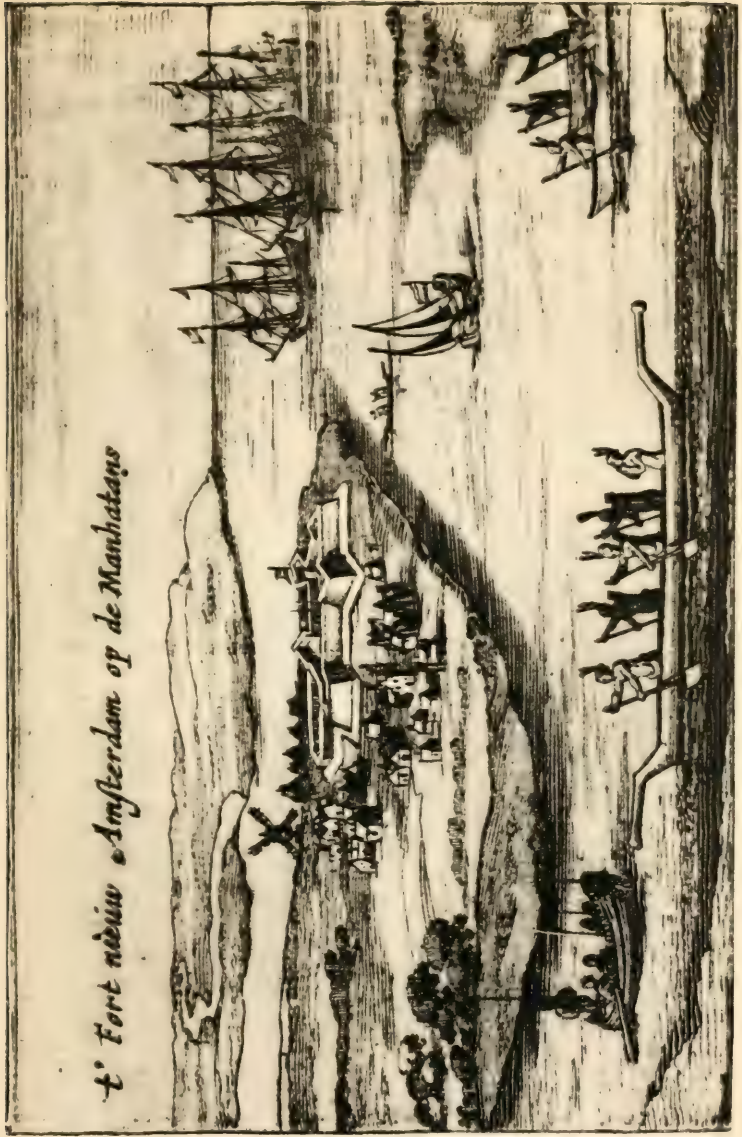
t' Fort nieuw Amsterdam op de Manhattan