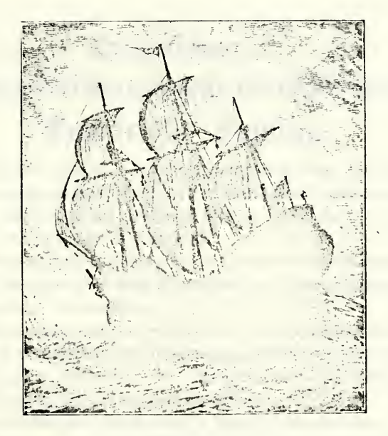
THE "BRINDLED COW." [See Page 6.]