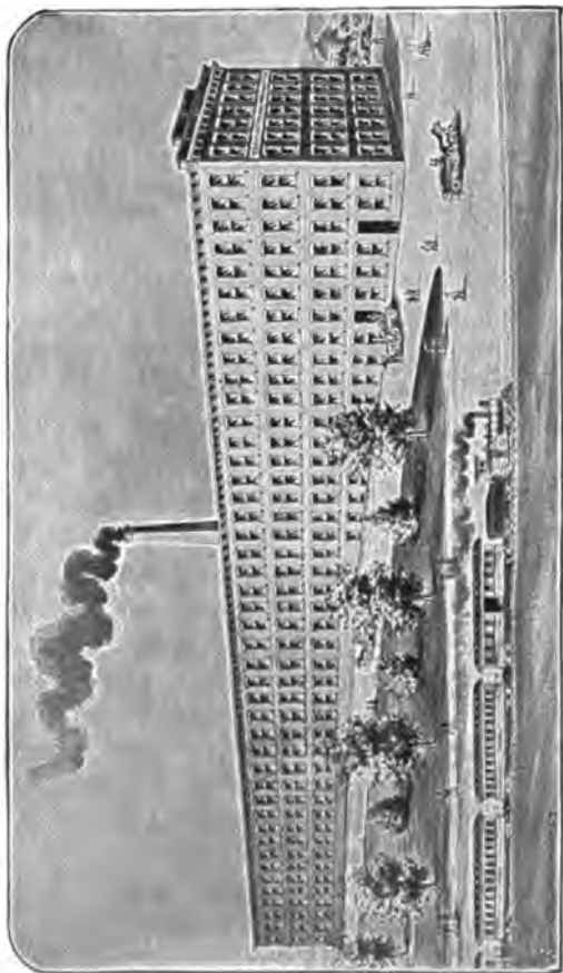
THE VERMONT FARM MACHINE CO.'S WORKS, AT BELLOWS FALLS, VT.