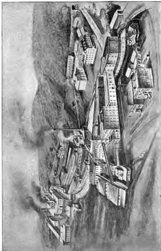
THE FAIRBANKS SCALE WORKS, AT ST. JOHNSBURY, VT.