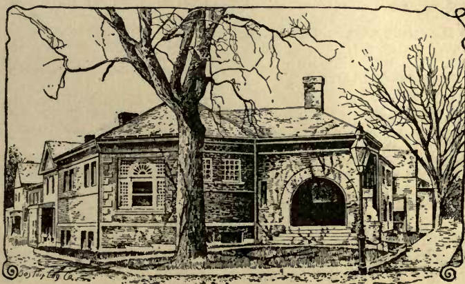
DEDHAM HISTORICAL SOCIETY BUILDING.