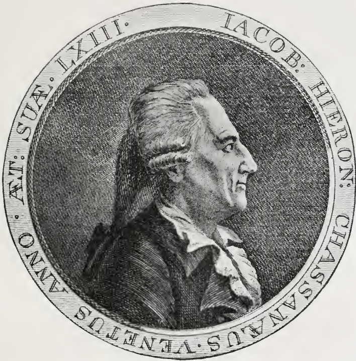
CASANOVA AT THE AGE OF 63.