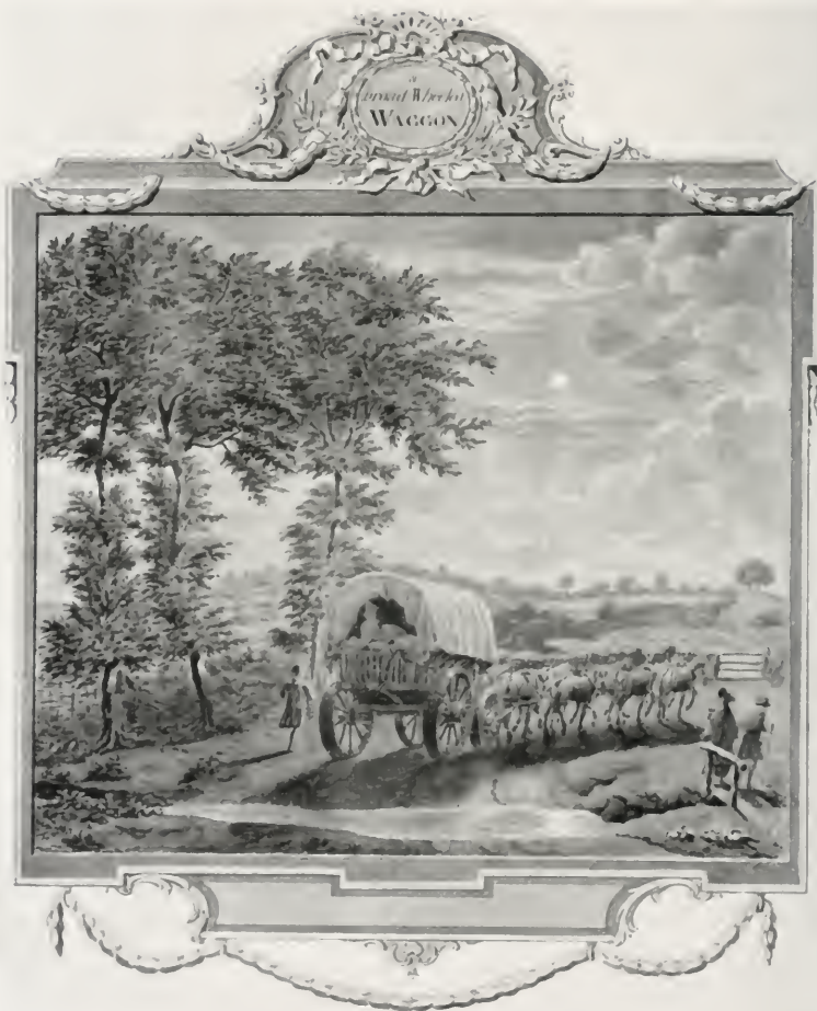
From an Eighteenth-Century Drawing.