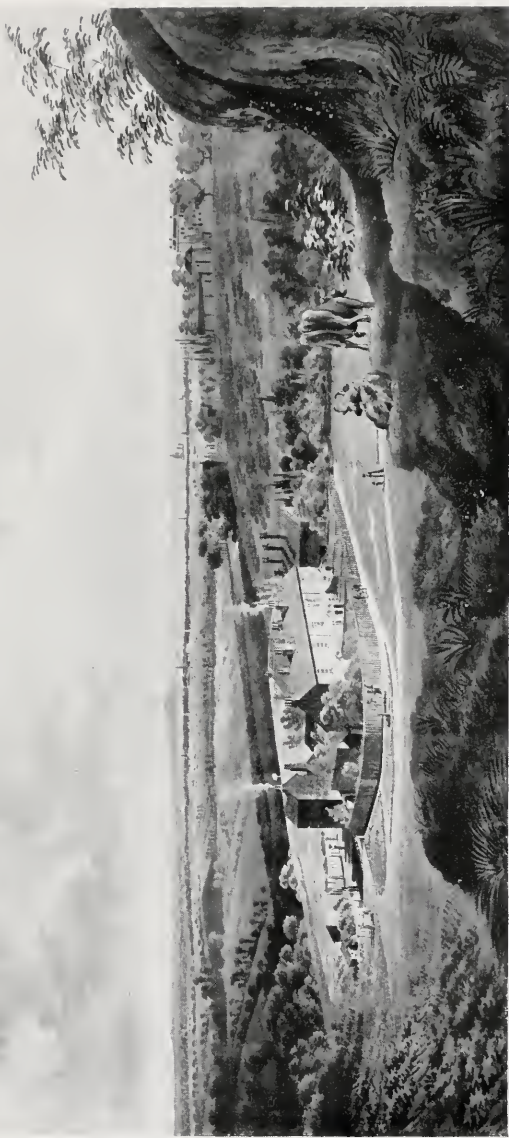
HAMPSTEAD HEATH IN 1804.