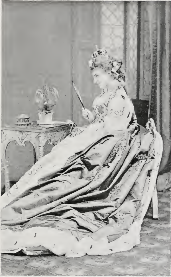
HORTENSE SCHNEIDER.