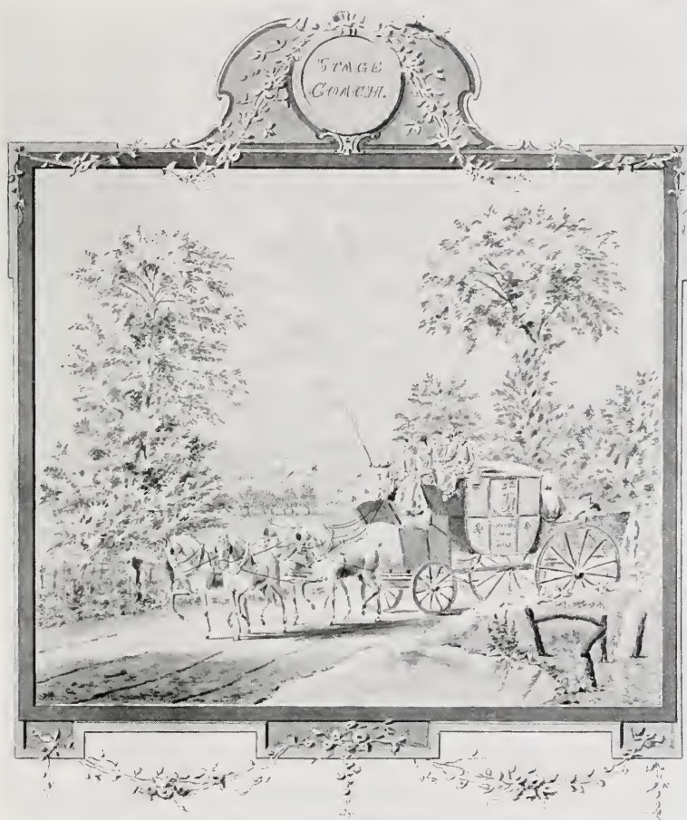
From an Eighteenth-Century Drawing.