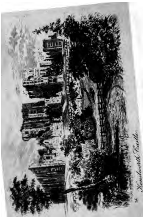
x Hemilworth Castle.