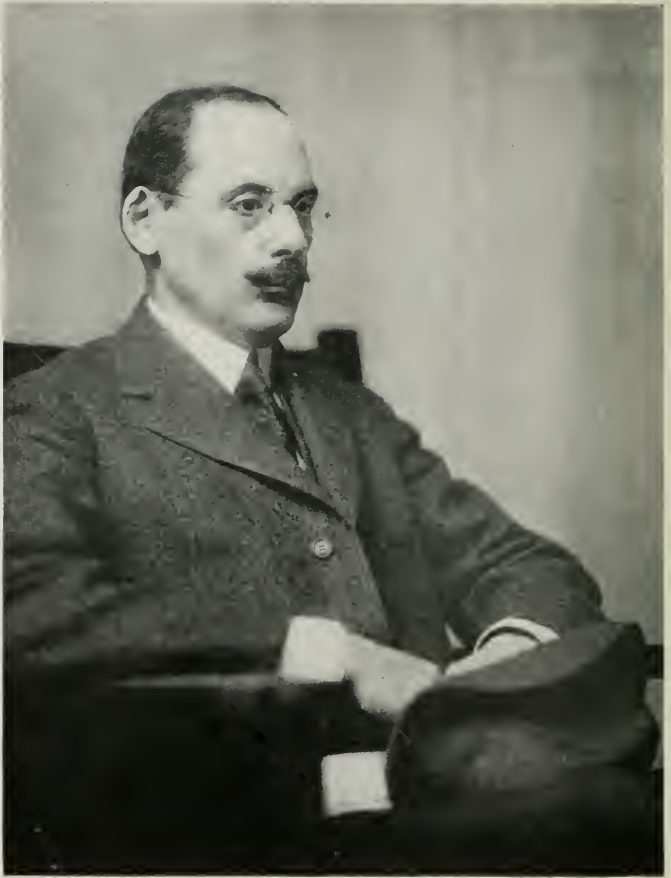
Edwin Arlington Robinson