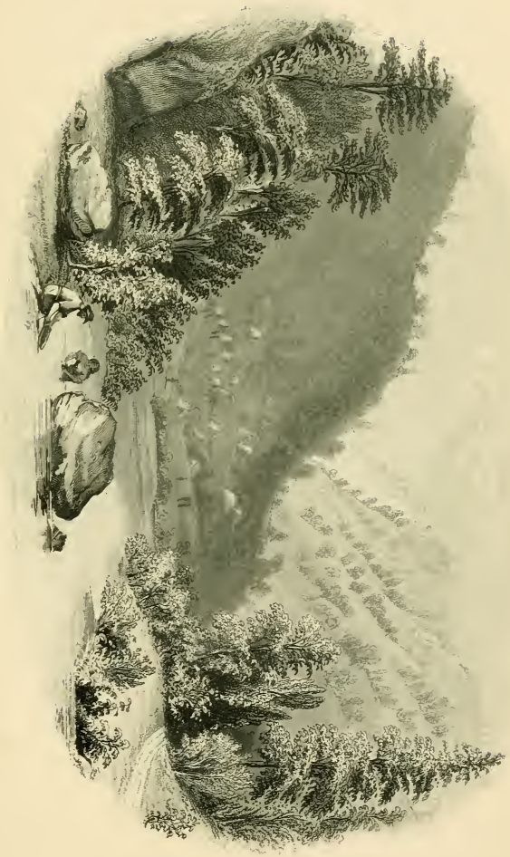
TOWER FALL MICHIGAN RIVER