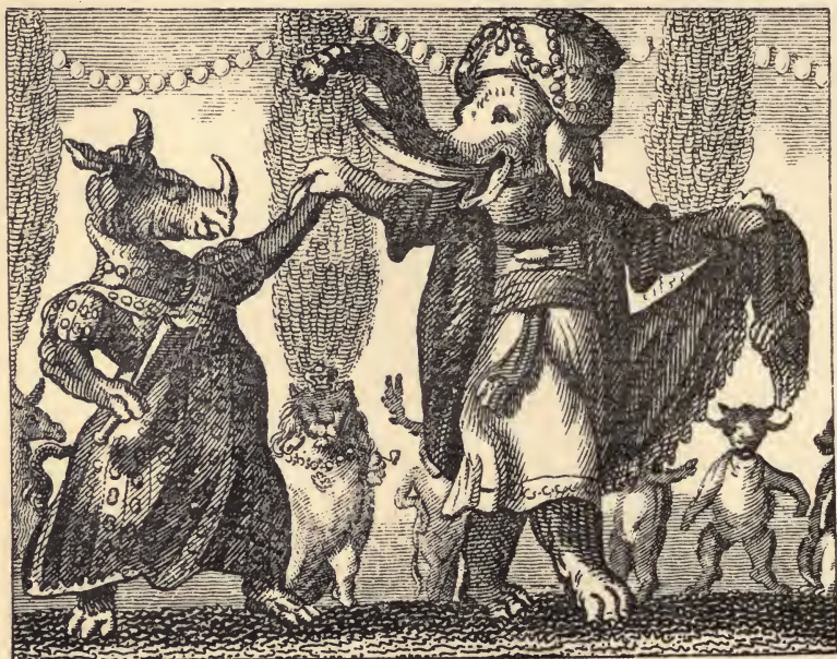
"The Elephant state by majestic & tall." p.11.