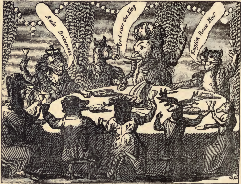
Rule. Britannia, the Lion sung, &c. p. 45.