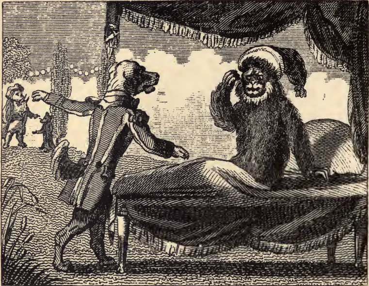
"The Moth when Invited got up with much pain". p.7.