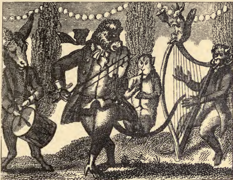
"The Monkey the fiddle delightfully played." p.10.