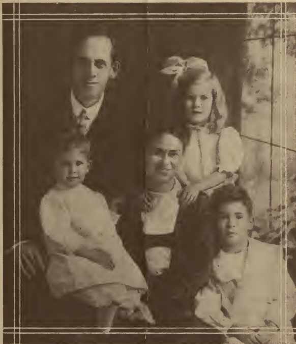
Our Beloved District Superintendent and His Family