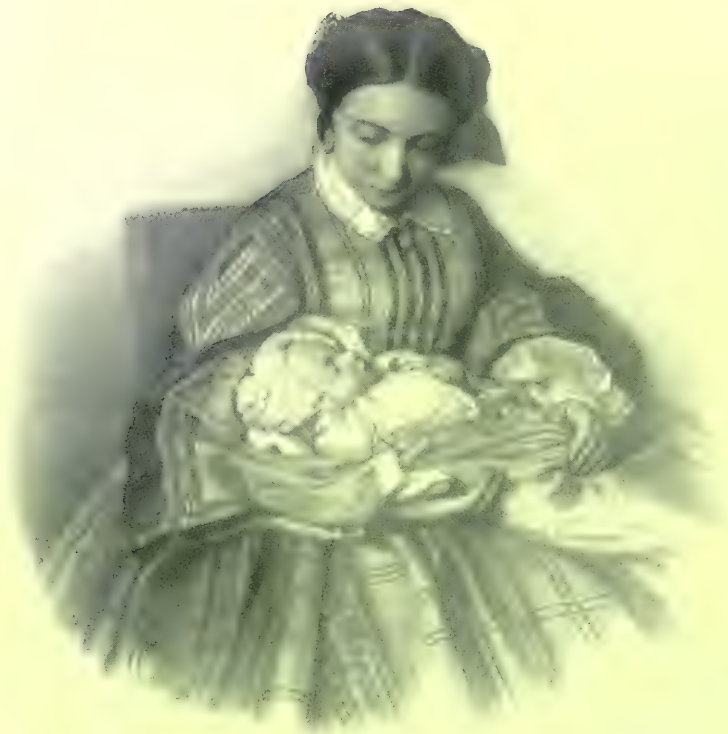
H.R.H. THE PRINCESS FREDERICK WILLIAM OF PRUSSIA PRINCESS ROYAL OF GREAT BRITAIN AND IRELAND AND THE INFANT PRINCE FREDERICK WILLIAM VICTOR ALBERT, MAY 1859