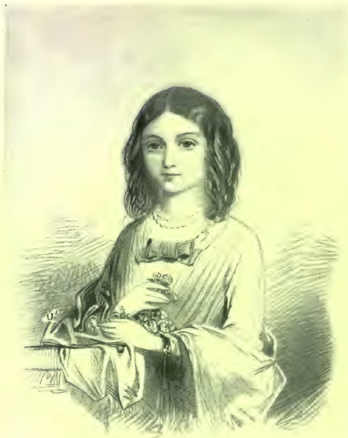
THE PRINCESS ROYAL VICTORIA ADELAIDE MARY LOUISA BORN NOVEMBER 21, 1840