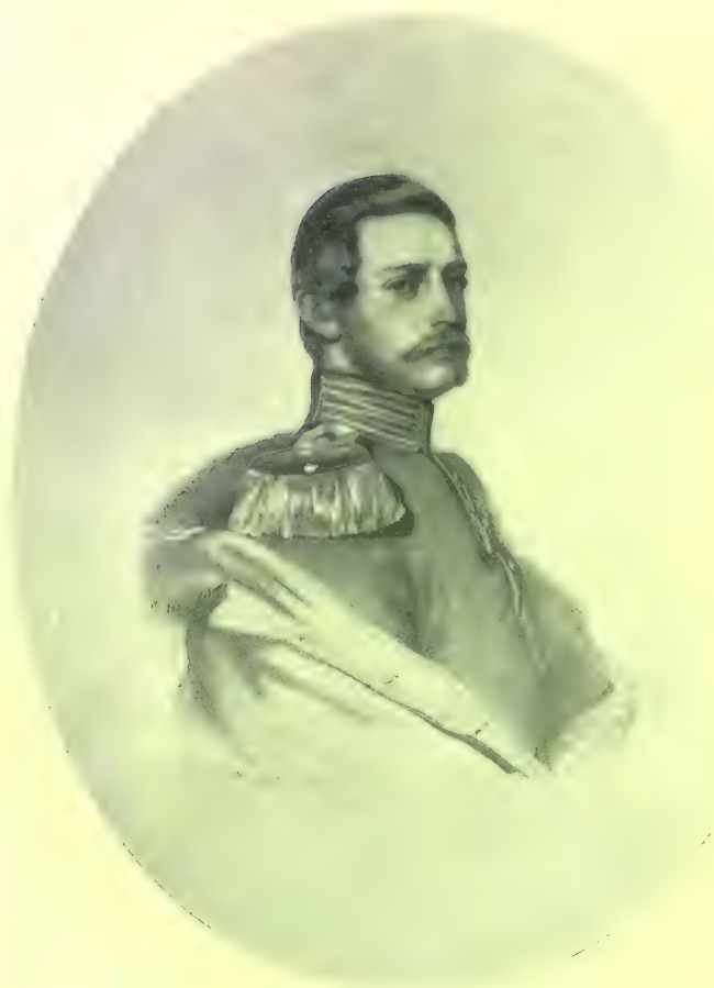
HIS ROYAL HIGHNESS PRINCE FREDERICK WILLIAM OF PRUSSIA PAINTED AT BUCKINGHAM PALACE, JUNE 1857, BY WINTERHALTER