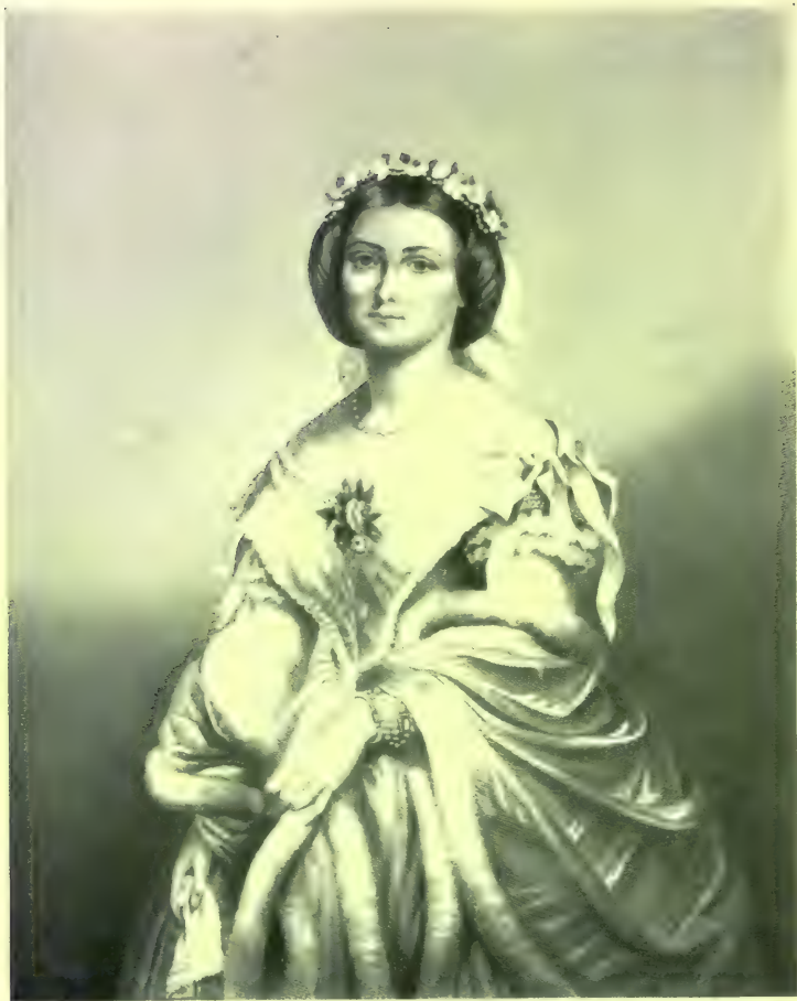
HER ROYAL HIGHNESS PRINCESS FREDERICK WILLIAM OF PRUSSIA MARRIED JANUARY 25, 1858