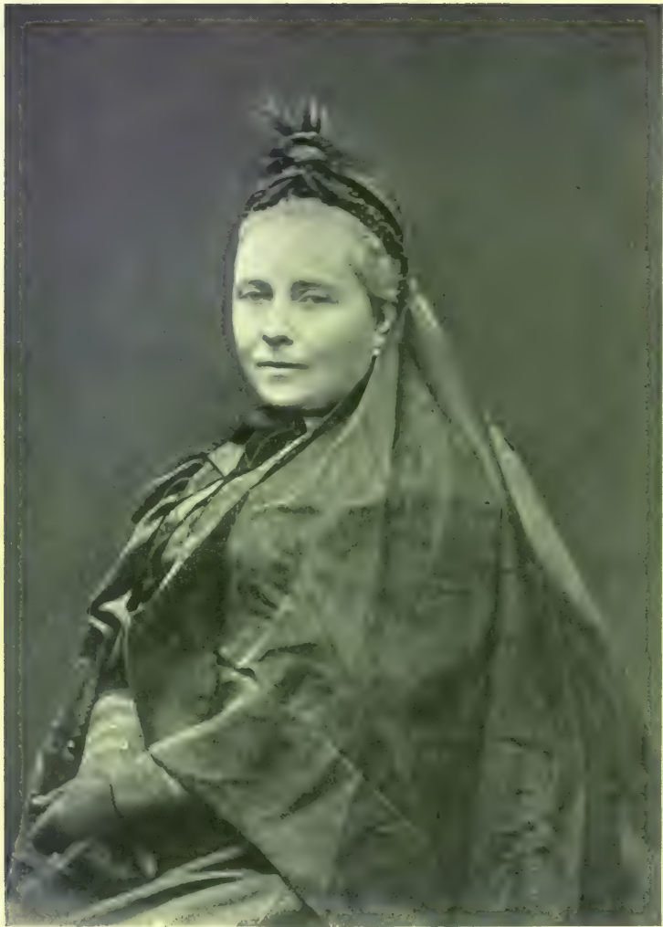
THE LATE EMPRESS FREDERICK