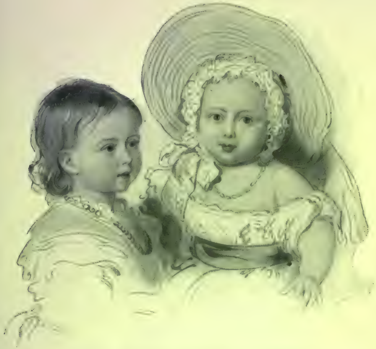
THE PRINCE OF WALES AND THE PRINCESS ROYAL PAINTED BY COMMAND OF THE QUEEN