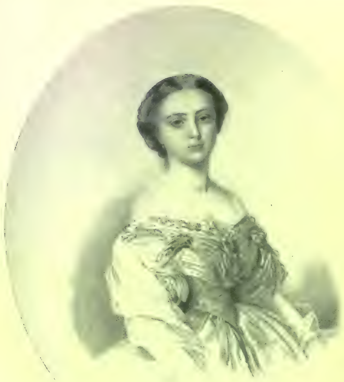
HER ROYAL HIGHNESS VICTORIA, PRINCESS ROYAL 1856