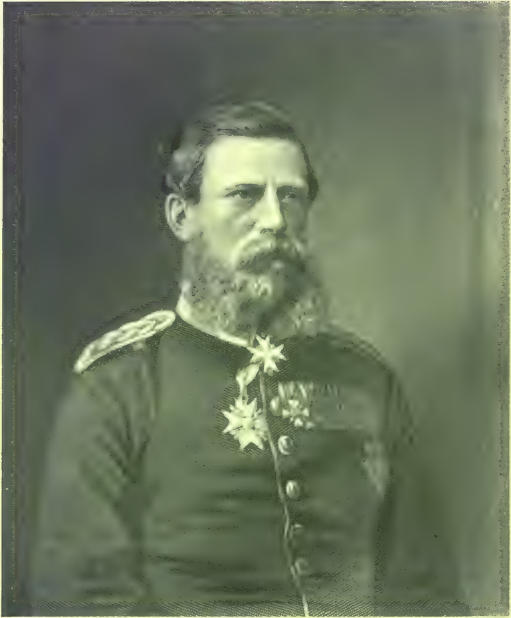
FREDERICK WILLIAM CROWN PRINCE OF PRUSSIA AFTER THE FRANCO PRUSSIAN WAR