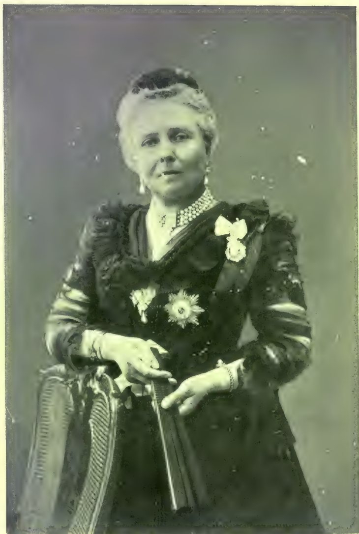
THE LATE EMPRESS FREDERICK