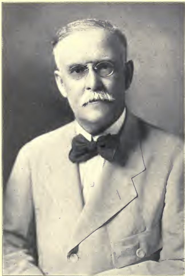
BENJAMIN IDE WHEELER A.B., A.M., Ph.D., LL.D., Litt.D., L.H.D. President of the University of California