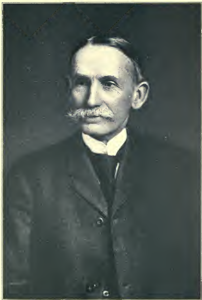
JOHN BATES CLARK. A.B., A.M., Ph.D., LL.D. Member Executive Committee, League to Enforce Peace