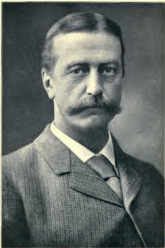
A. LAWRENCE LOWELL, A.B., LL.B., LL.D., Ph.D. President of Harvard University. Chairman of the Executive Committee, League to Enforce Peace