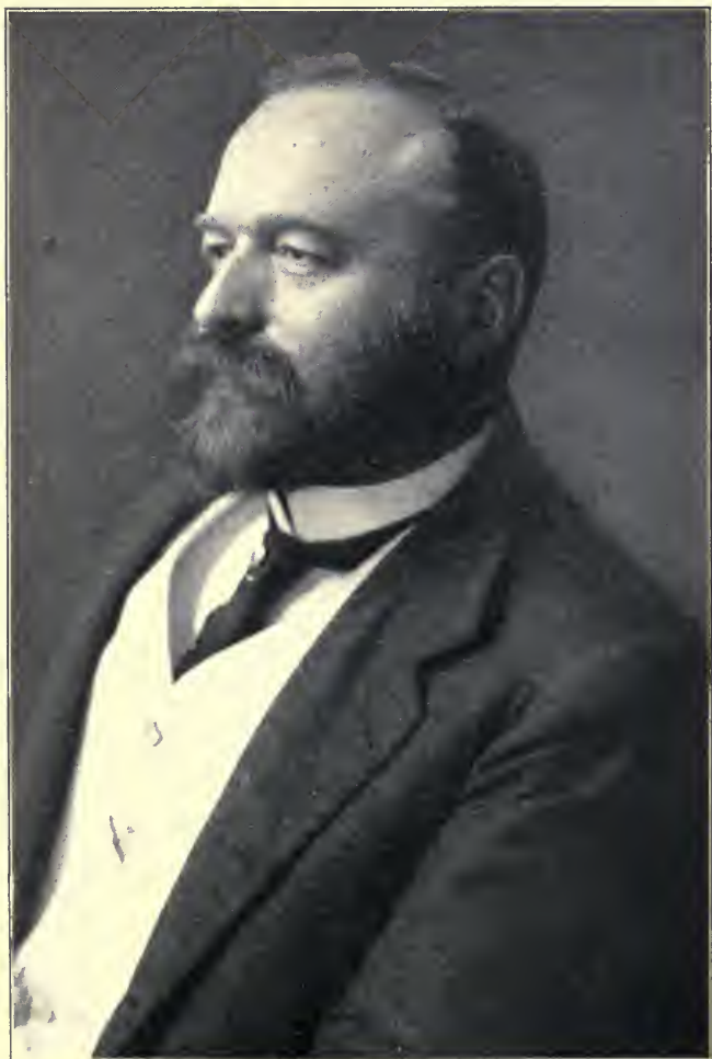
FRANKLIN H. GIDDINGS, A.B., Ph.D., LL.D. Professor of Sociology and History of Civilization, Columbia University