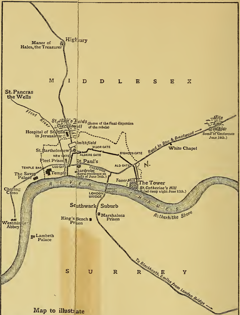
Map to illustrate THE EVENTS OF JUNE 12-15. 1381.

The dotted line is the area of the city, the black line is the city wall and ditch, at that time in very good repair. There were probably houses between the wall and the outer boundary. There were certainly houses round Smithfield.