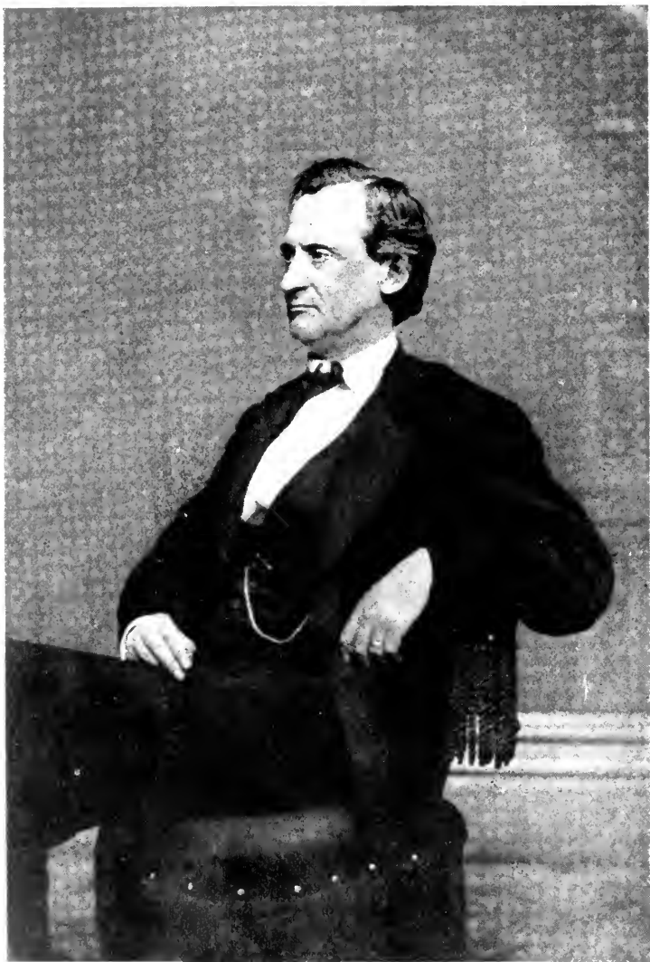
ENOCH LOUIS LOWE. GOVERNOR OF MARYLAND, 1851-'54. From an oil painting in the State House, Annapolis, Maryland.