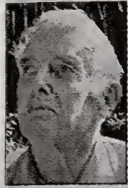
David Brower, by turns gracious and combative, inspired respect from adversaries.

Environmental powerhouse, Sierra Club leader and Friends of the Earth founder David Brower was pictured at his Berkeley home in December.