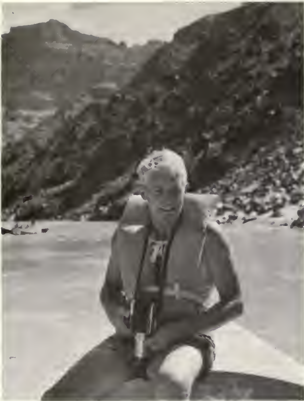
In the Grand Canyon (ca. 1965)