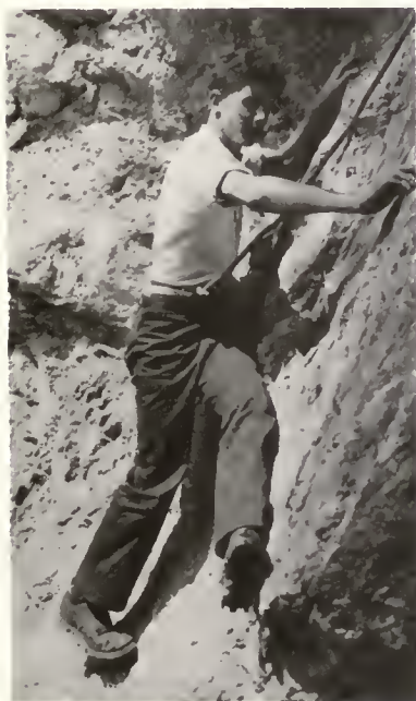
Learning, Indian Rock, Berkeley, 1934