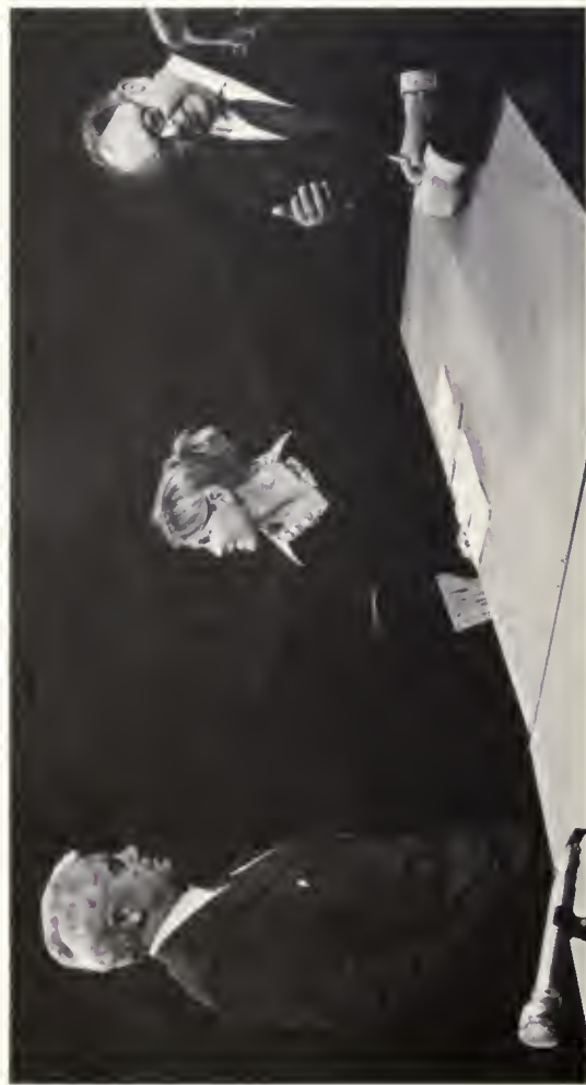
(left) Debate with Herman Kahn, KCET (Los Angeles), 1973