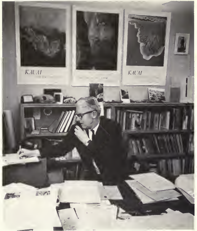
Executive Director, Sierra Club (ca. 1967)