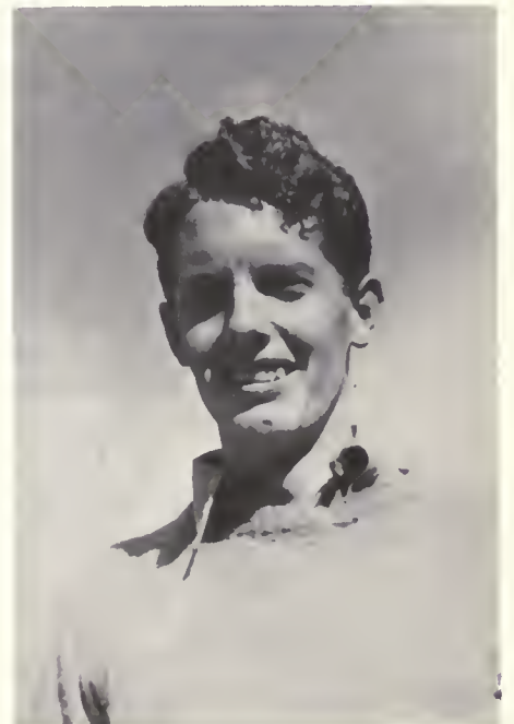
David Brower, 1935