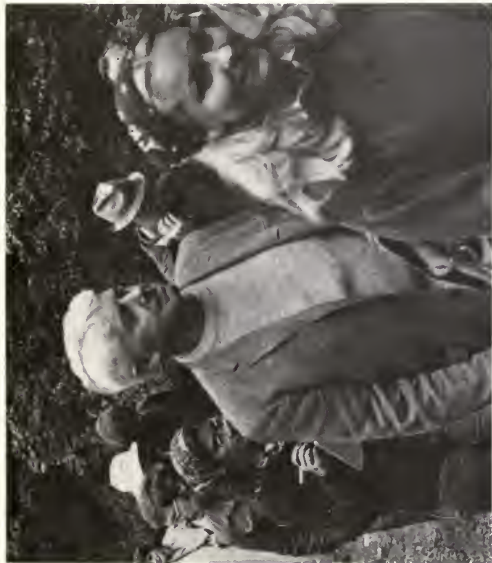
Visiting Scholar, Case-Western University, Cleveland, Ohio, 1974