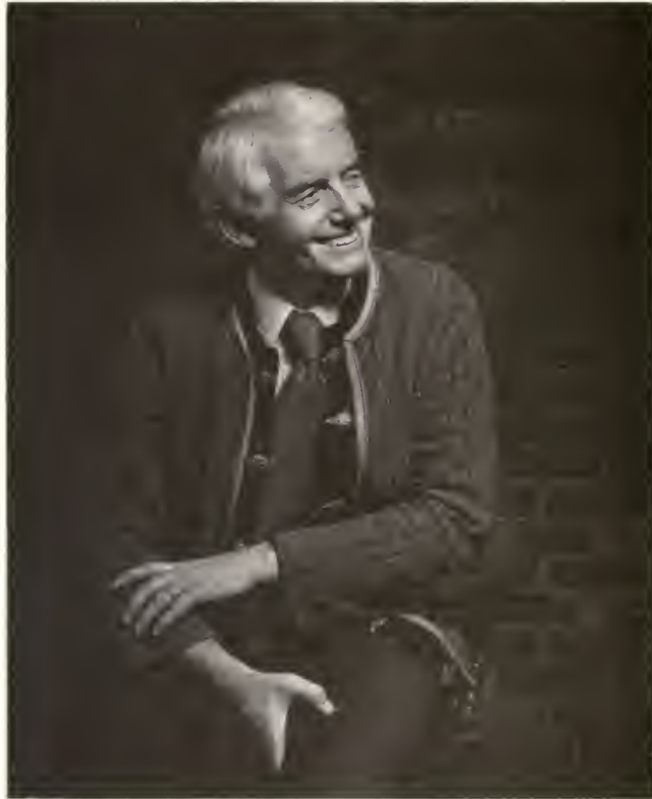
DAVID ROSS BROWER 1979