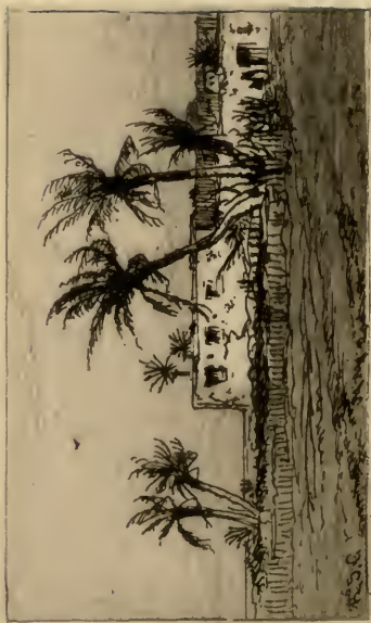
The first plate Etched in the New York Etching Club