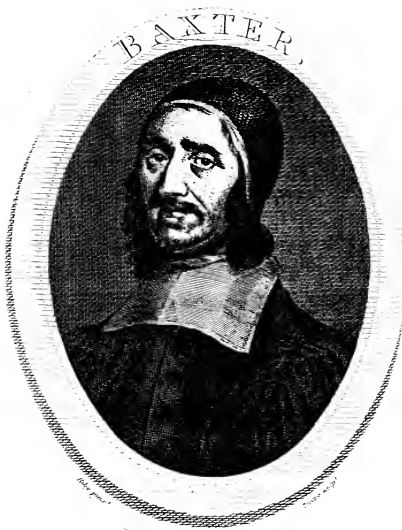
From the Original Print in N. 2. Sup. 1. 1. 2. 1794