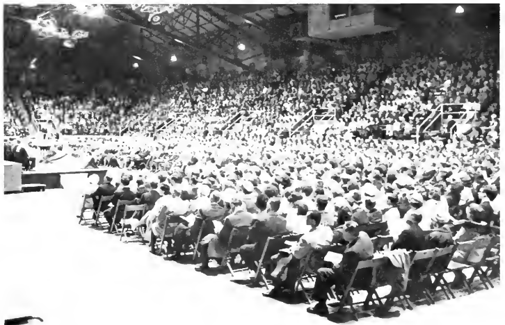
View of the vast throng attending the 1965 Graduation.

The "Evangelical Recorder" will be issued four times a year, and we trust it will be a blessing and a help to the Lord's people, during these days when so many seem to have erred from the truth.