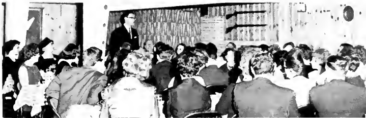
'65 Class President addresses fellow class members and General Executive at Alumni Welcoming Dinner.