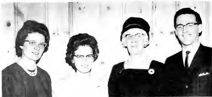
Graduates Span Half Century

'65 Class Executive with Class '15 Member.