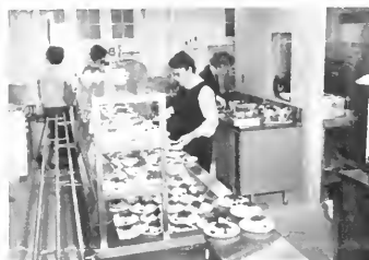
The Kitchen . . .

Our Dining Room is also your Dining Room!