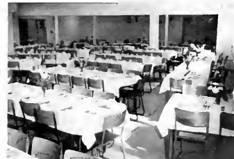
. . . and the Dining Room AFTER.

Then the Dining Room, in sparkling new dress, was ready. With a capacity for 300, we can accommodate nearly twice as many as before.