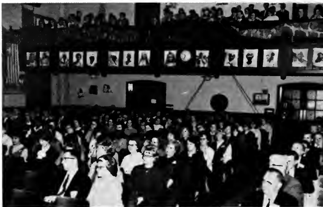
View of large audience that attended each session of the Conference.