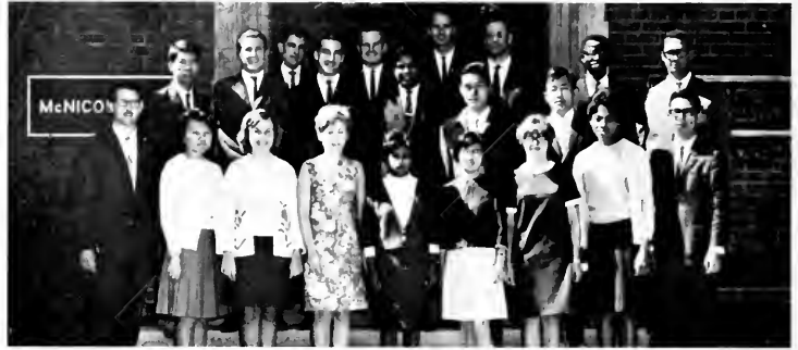
21 NEWLY ARRIVED INTERNATIONAL STUDENTS to join the many others in sophomore and senior years.

Authorized as second class mail, by the Post Office Department, Ottawa, and for payment of postage in cash, place of distribution — Oshawa, Ont.