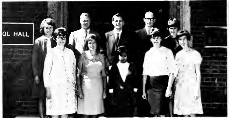
SCHOOL TEACHERS ARRIVE FOR THEIR FIRST YEAR AT T.B.C.:

Missions have already heartily endorsed this step, and at present one missionary is taking advantage of the opportunity. Should anyone be interested, further information is available from the Director of Admissions. Here is an excellent opportunity to do that extra study and preparation that you dreamed about while on the field. We feel it is a privilege to help you. Write us soon.