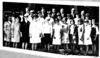
FRESHMEN AT T.B.C.