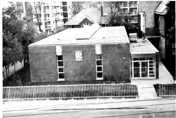
The new J. William Horsey Library, seen from the air.

Yes—our freshmen have joined the ranks of good soldiers of Jesus Christ. Pray for them.