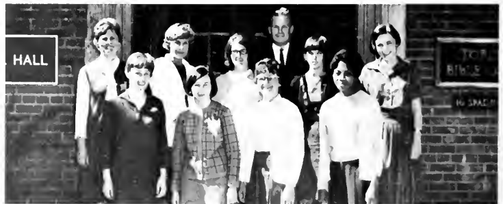
OUR FRESHMAN NURSES . . . AND ONE DOCTOR!