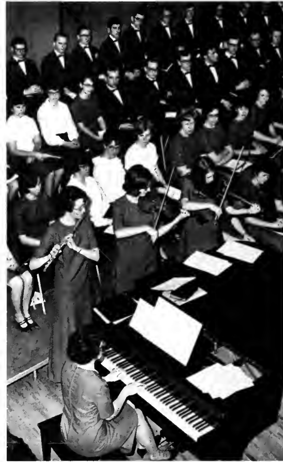
The Ladies' Instrumental Trio play a carol medley during the London Christmas Program.