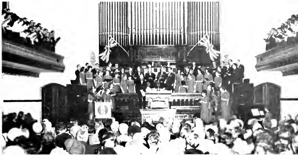
"Christmas Festival of Lights" at Cooke's Church, Toronto.