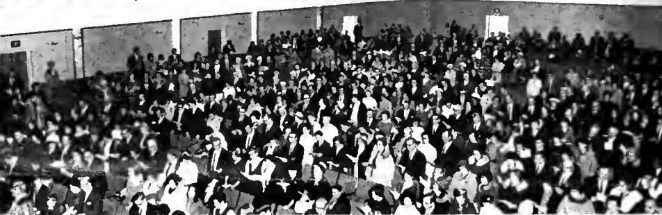
Centennial Hall, London, was nearly filled for the Christmas Festival of Lights held in L.C.B.M.'s home town.