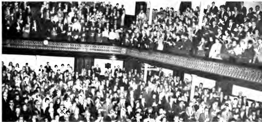
Audience fills Cooke's Church for Christmas program.