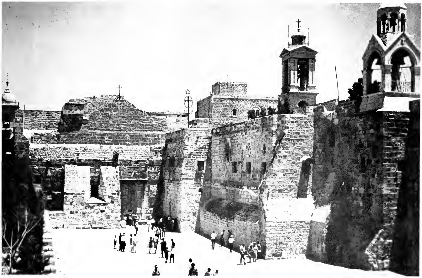
SHALOM '69! Bethlehem: Nativity Square in Bethlehem is located just outside the Church of the Nativity, which marks the location of the birth of Jesus.

LUKE, 2. 11 . For unto you is born this day in the city of Dā'vid a Saviour, which is Christ the Lord.