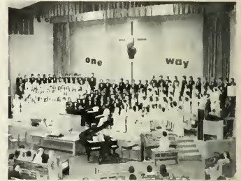
O.B.C. Students presented "One Way" at four Christmas Concerts. Here they are at Peoples Church, Willowdale.

The discipline of the tongue (James 3) will show the discipline of the heart. The two are linked together. Perhaps we too need to pray Isaiah's prayer, and let God do His cleansing work. (Isaiah 6:1-8).