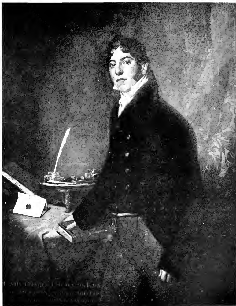
THE EARL OF SURREY