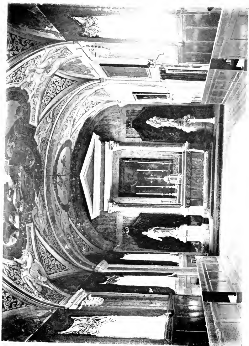
CHAPEL OF ENGLISH COLLEGE, ROME