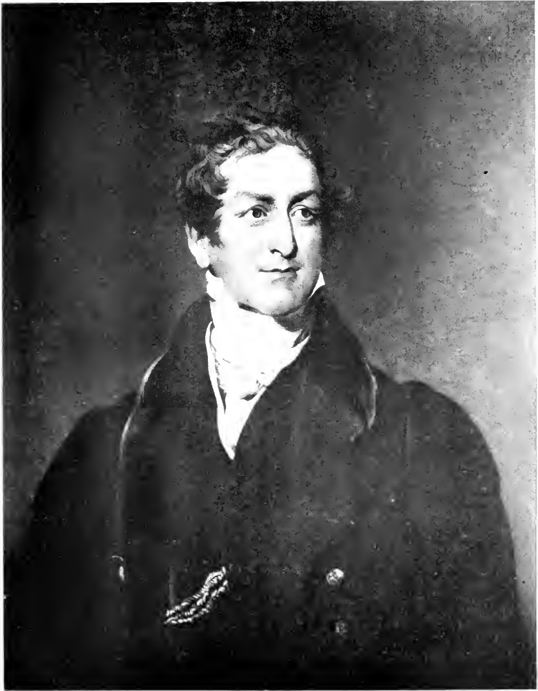
SIR ROBERT PEEL.