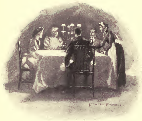
“ THAT LITTLE SUPPER ”