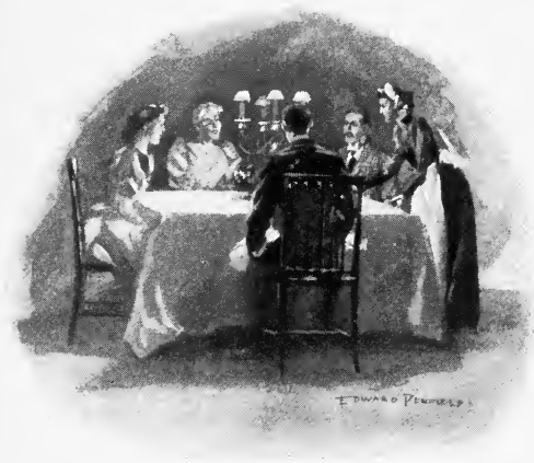
" THAT LITTLE SUPPER "