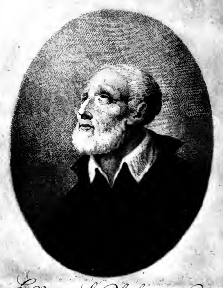
Effigies S. Philippi Norii Ex Archetypo, quod extat in Ecclesia P.R. CongOrat Abdia Anno Congregationis restituta moccocxen .