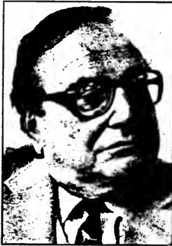
Seymour Martin Lipset