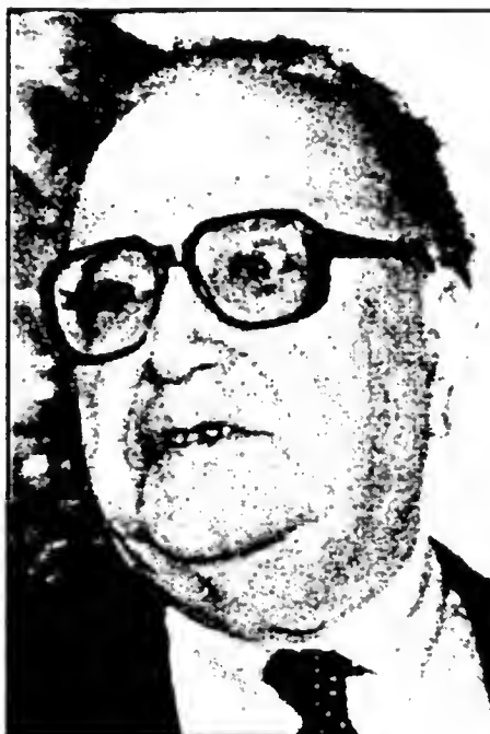
Seymour Martin Lipset

Israel, they say, is the "X factor" among American Jews. While most say, "If Israel were destroyed, I would feel as if I had suffered one of the greatest tragedies of my life," there is an ambivalence to that relationship.