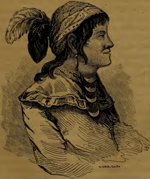
As-se-he-ho-lar. (known as Osceola, or Powell.)