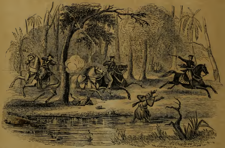
Death of Waxe-hadjo.