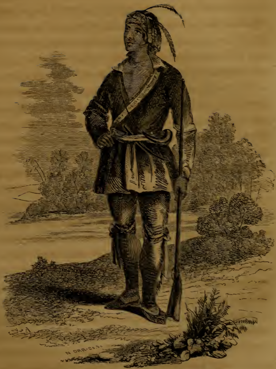
Talockio Tustenuggee (Tiger Tail)