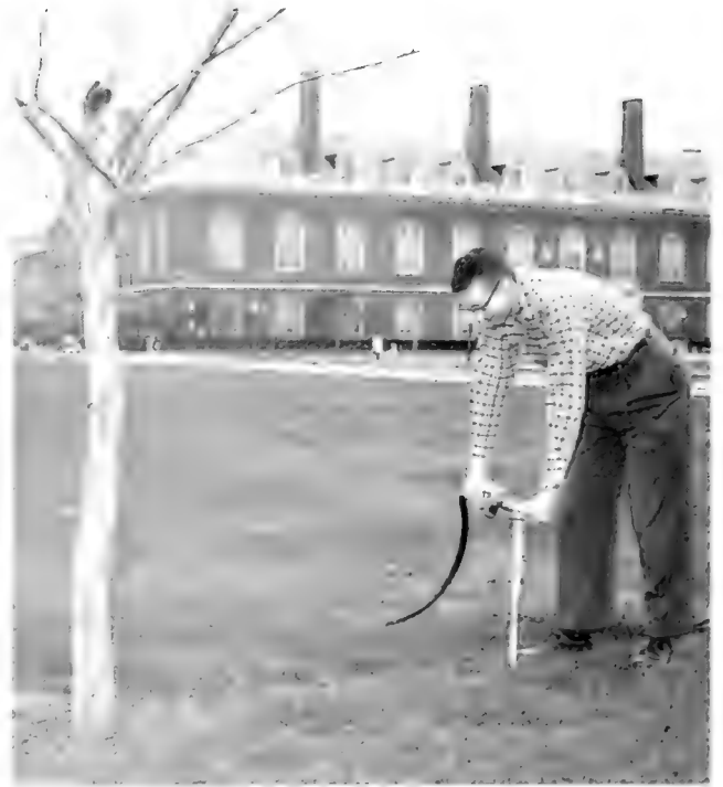
FIG. 5.—Hydraulic injection of liquid fertilizer at 150 pounds pressure through a soil needle.

The five kinds of fertilizers applied in holes were applied also by the soil injection method. Solutions of the five fertilizers were injected 18 to 24 inches deep with a soil needle (Fig. 5 and 6) and a hydraulic sprayer at 150 pounds pressure. The volume of fertilizer used at each injection point was carefully regulated by opening the soil needle valve for a predetermined number of seconds. Fifteen gallons of a fertilizer solution were used per tree. The 15 gallons of liquid fertilizer were evenly divided among 14 injection points about each tree. Four injections were made on four sides approximately 2½ feet from the tree trunk, and the remaining 10 injections were made in a