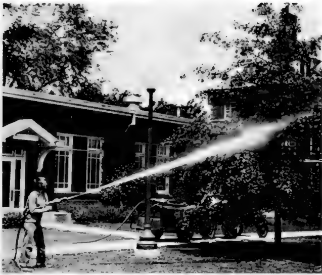
FIG. 7.—Foliage application of a liquid fertilizer. A hydraulic sprayer is used in this operation. The solution was applied until it began to drip from the foliage.

circle approximately 4\frac{1}{2} feet from the trunk. The 225 gallons of liquid fertilizer required for each treatment (three tree species, five trees each) were prepared in a 300-gallon hydraulic sprayer tank having an agitator.