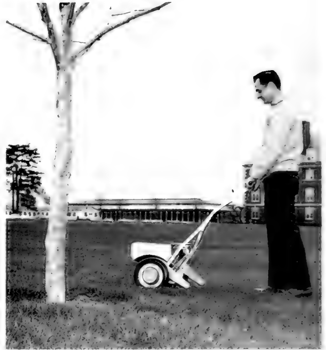
FIG. 8.—Surface application of dry fertilizer. A common lawn fertilizer spreader may be used in applying fertilizer to either grass or trees.

Each fertilizer was applied at rates of 3, 6, 9, and 12 pounds of N per 1,000 square feet on April 15, May 15, and July 30 in bands 20 inches wide and 20 feet long. The 6-pound rate required two applications at the 3-pound rate; the 9-pound rate required three applications; and the 12-pound rate required four applications. An additional test was made on May 15 and July 30 to compare the effect of applying fertilizers to wet grass. For this test, a strip of lawn 10 feet long was sprinkled with water immediately prior to applying the 20-inch-wide band of fertilizer.