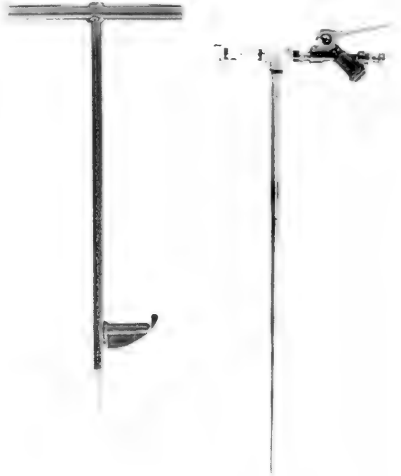
FIG. 6. Punch-bar (left) and soil needle designed and used by the authors of this publication. The punch-bar is made of a hardened steel axle on which are welded a foot rest and a handle. The soil needle is like types available commercially.