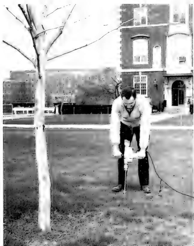
FIG. 2.—Electric drill being used to make holes in which dry fertilizer is placed in the soil around trees. The electric-drill method of making holes is more rapid than the punch-bar method, but it requires a heavy-duty drill and a source of electricity. It is especially useful when the soil is dry.

* Normal is an average of approximately 80 years of data taken from records of weather stations located in the Northeast Climatological Division of Illinois.