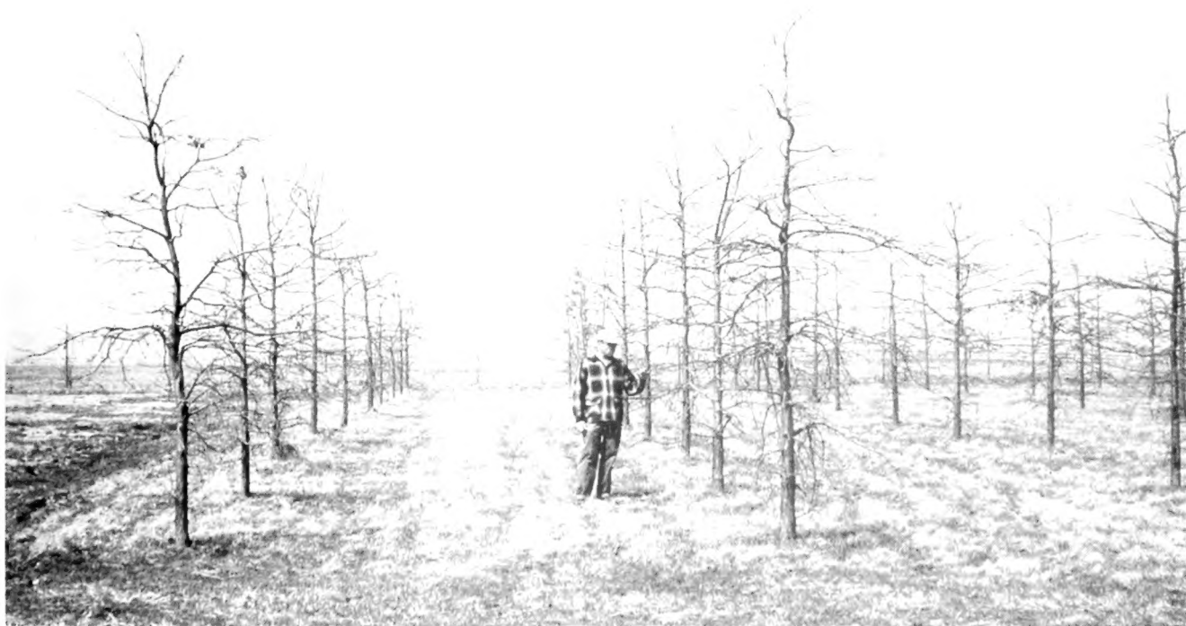
FIG. 1.—Part of plot of pin oak trees in the experimental area used for the investigation reported here. This is one of the four test plots located at the Morton Arboretum, Lisle, Illinois. The picture was taken in April, 1965.

Four methods of application and several fertilizers were used in 16 different combinations (Table 4), each combination designated as a treatment. Each block of trees