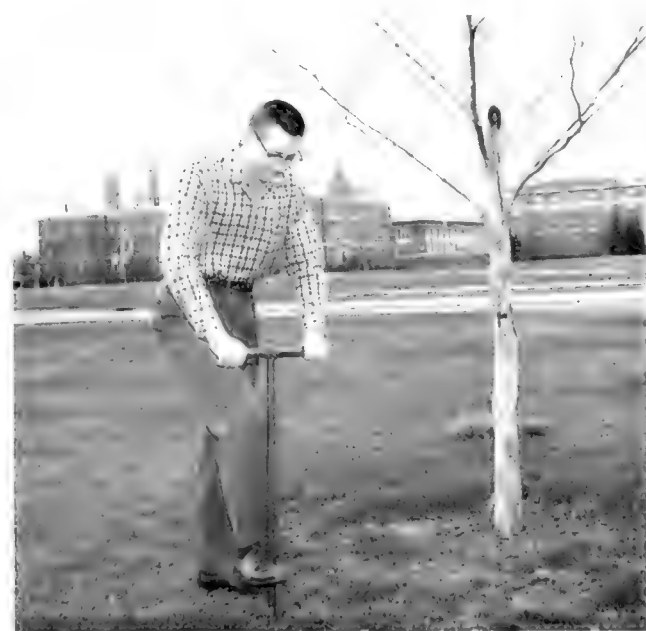
FIG. 3.—Punch-bar being used to make holes in which dry fertilizer is placed in the soil around trees.

Five fertilizers were evaluated by being applied, in dry form, in holes made in the soil. The fertilizers used were ammonium nitrate, urea, PK, NPK, and NPK plus minor