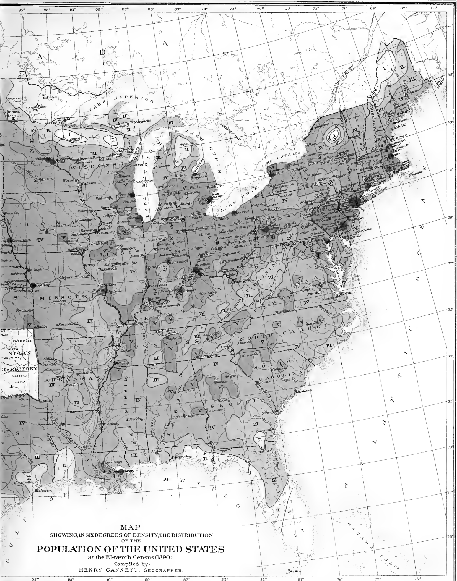
MAP SHOWING, IN SIX DEGREES OF DENSITY, THE DISTRIBUTION OF THE POPULATION OF THE UNITED STATES at the Eleventh Census (1890) Compiled by HENRY GANNETT, GEOGRAPHER.