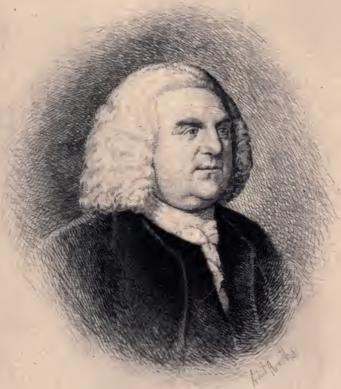
WILLIAM ALLEN Chief Justice of Pennsylvania. Nat. 1704.— Ob. 1780.