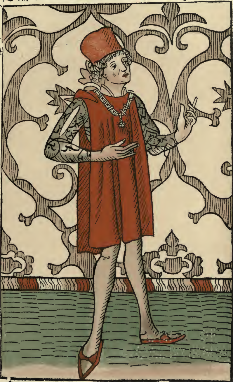
Quaritch's Illustrations, No. 134.

Das ist der edel Ritter · Marco polo von Stenendig der groest landfartre · der uns beschreibet die groestlen countre der welt bis zu dem nydergag der summe · der gleyche vor nicht meer gehoer seyn die selbe geschicht hat · von dem auffgang