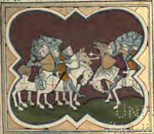
Quaritch's Illustrations, No. 120. Griggs fecit 1890.

L ivre des iuges en hebreu est appelle; sothim. li plent des ju ges qui iugierent isrl' iusques a heli le souuerain prestre. Si est pour ce appelle; li livre; des iuges poure ql plent deulz. Ne que dont dient aucun ql est appelle; li livre; des iuges poure q chascun des iuges mist en escript ce q il aduint en son temps. Mais on ne soet mie qui les assemblea tous ense ble en cest livre. Li auquant dient q samuel. Li autre dient que herodias. Mais il semble mie que ce fust eze chiel qui les paraboles salmona les li ures des roys assemblea ensemble. Son demande pourquoy moyses & josue ne sont mie compte; entre les iuges. No dions qui ne iugerent mie le pueple sanz plus ains le gouvererent avec ceus li autre juge dont nous plerons a. noient nul droit en gouverer le pueple. ne sus eulz fors de tant que le pueple en leur tribulations vsoit de leur conseil.