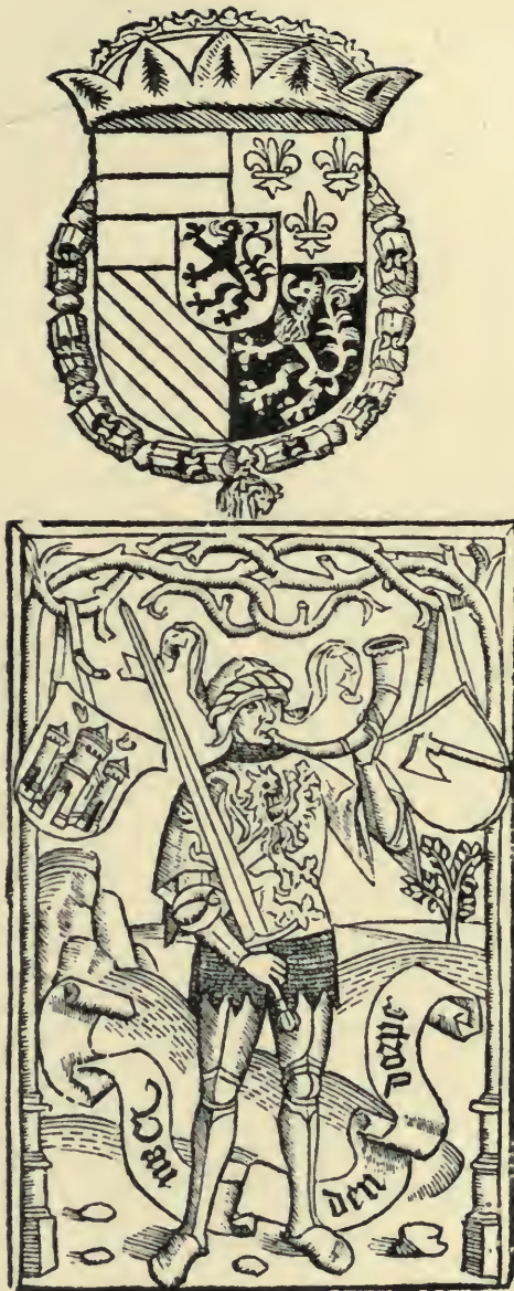
Quaritch's Illustrations, No. 136. Griggs fecit 1890.